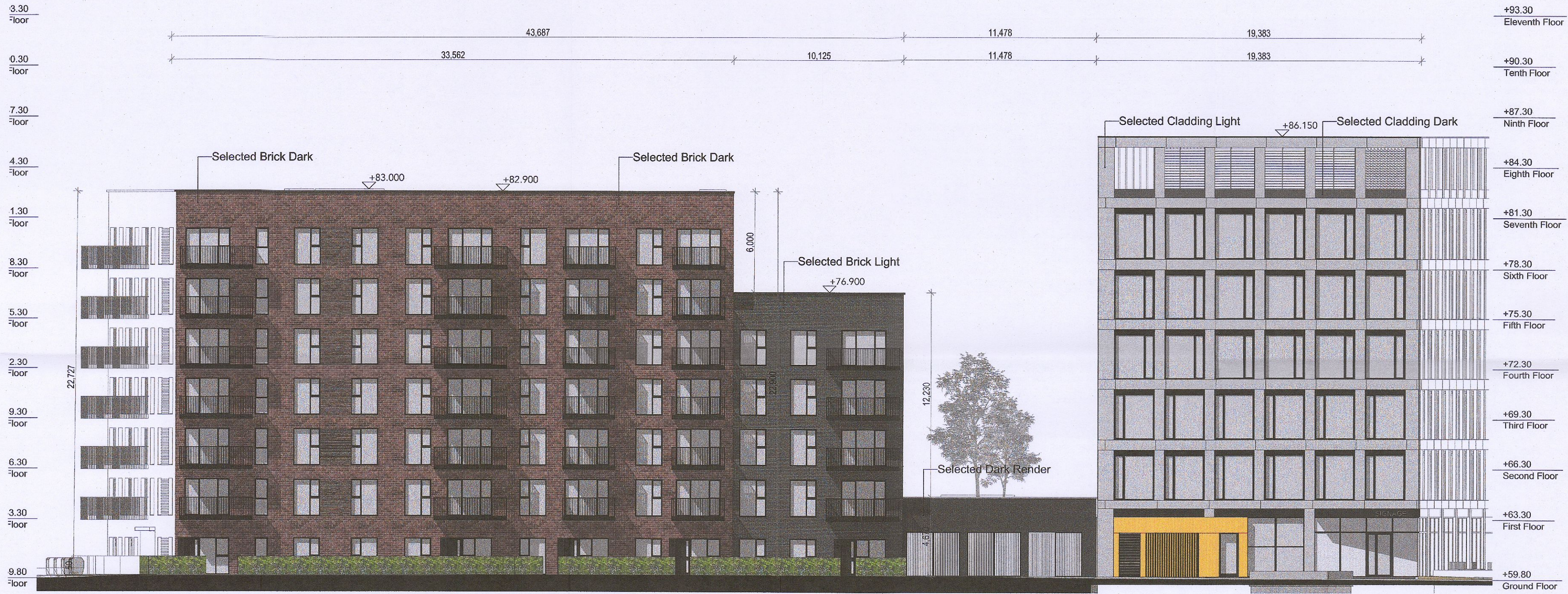
Elevation East SCALE:1:200