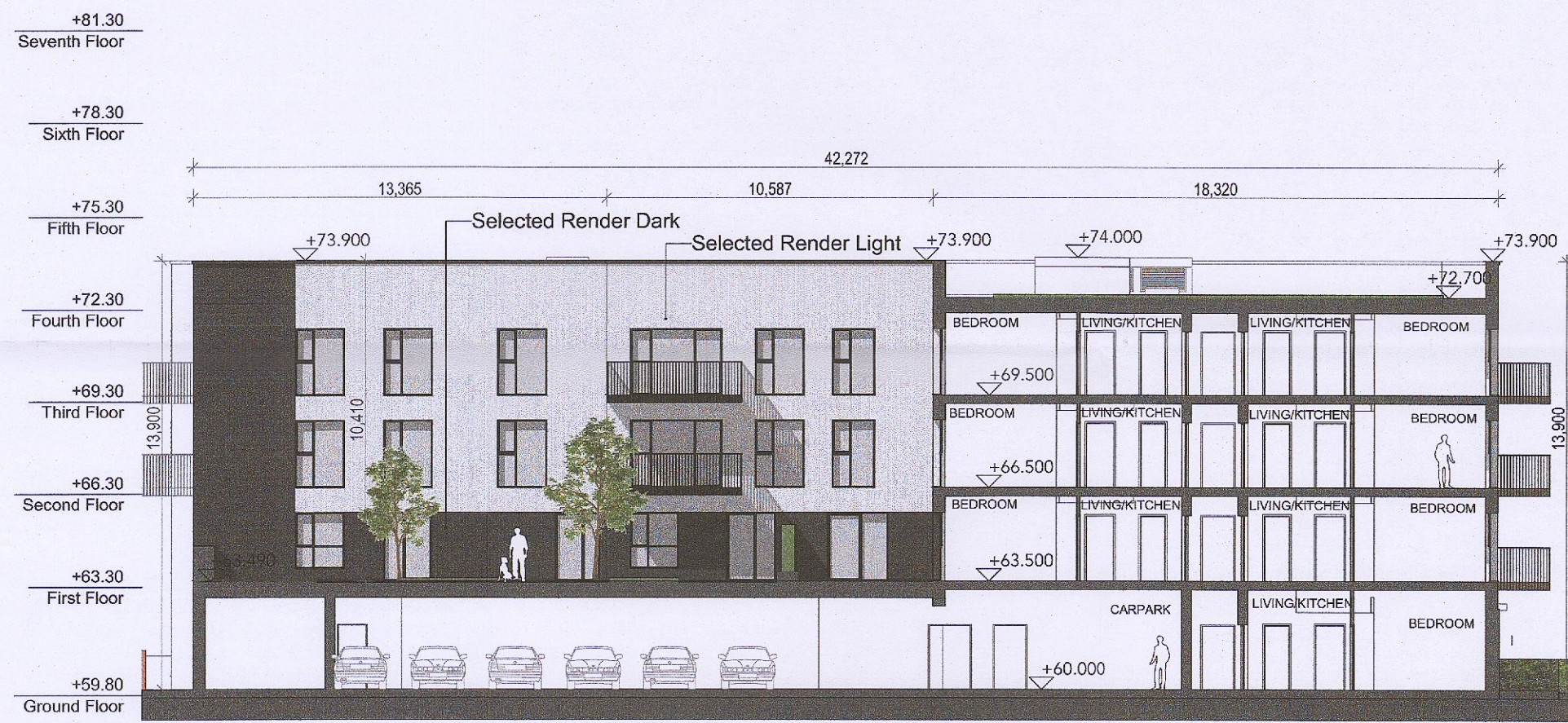
Elevation 01 SCALE:1:200