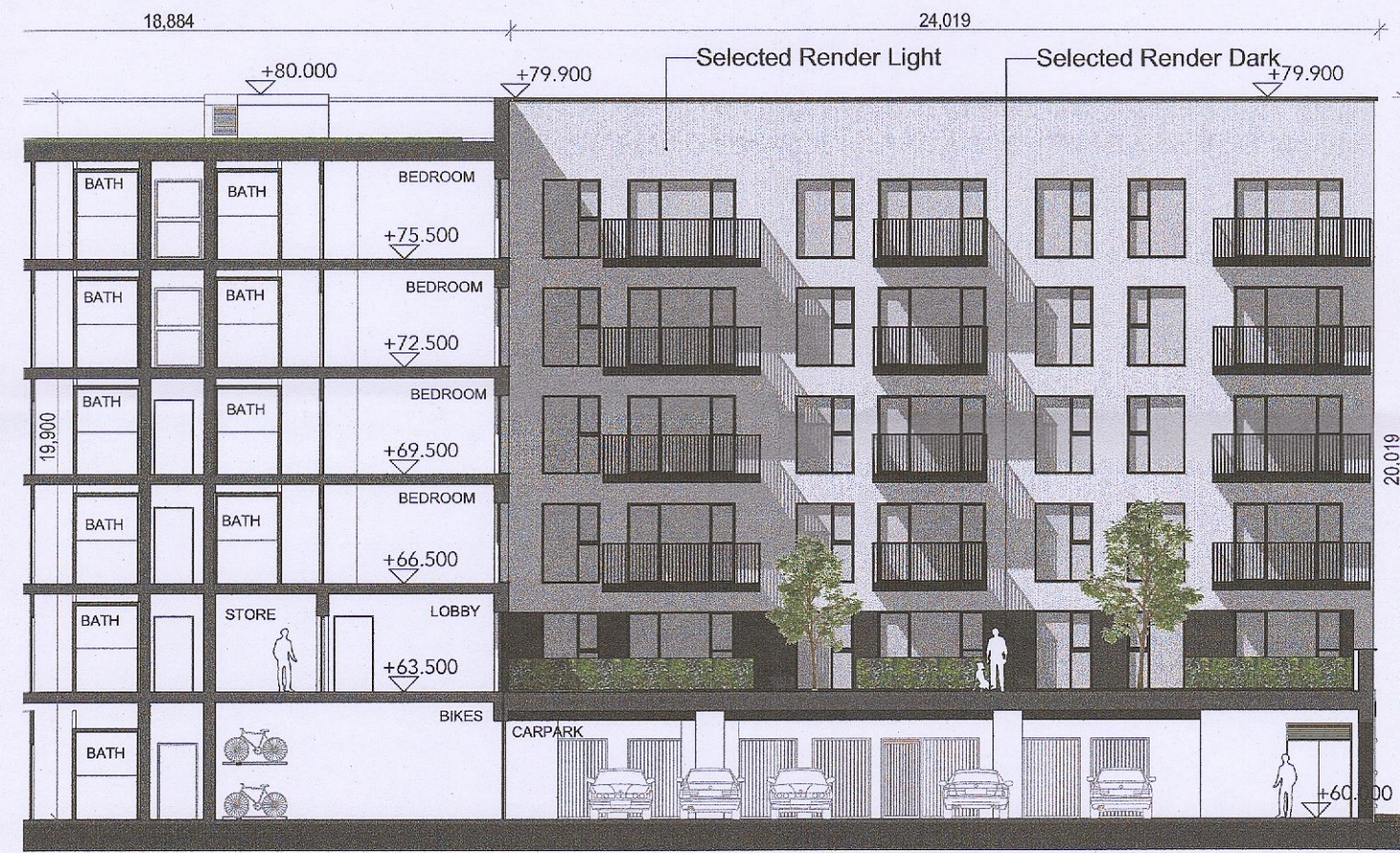
Elevation 03 SCALE:1:200