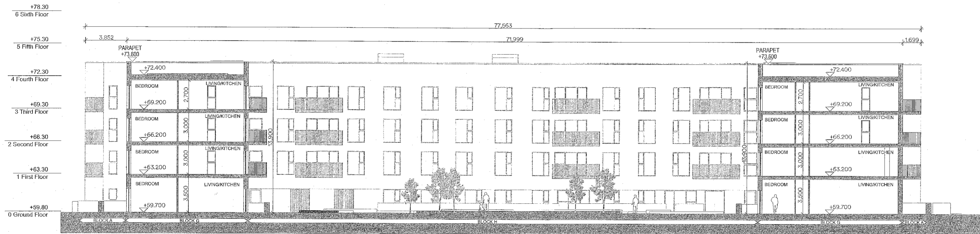
Section GH 2 SCALE:1:200