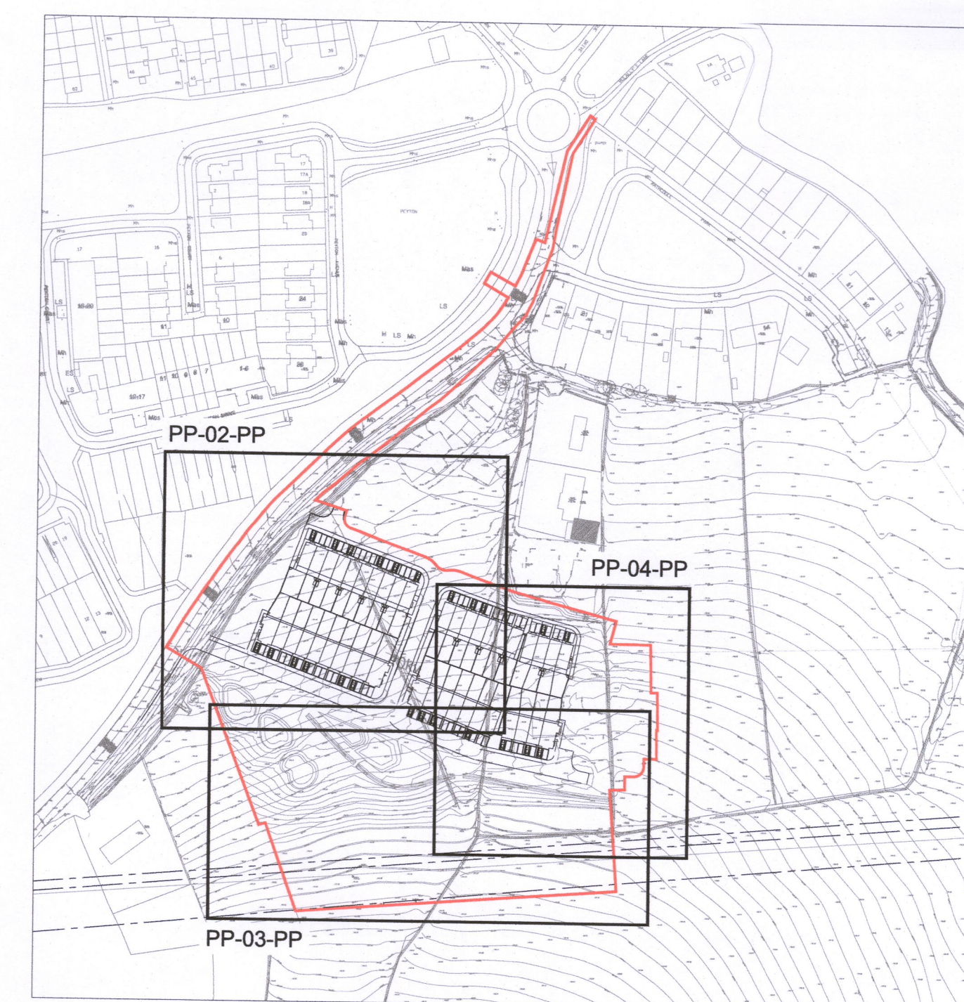
KEY PLAN n.t.s