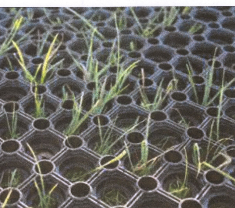
D 05 Root barrier or similar and approved supplier: http://green-tech.co.uk