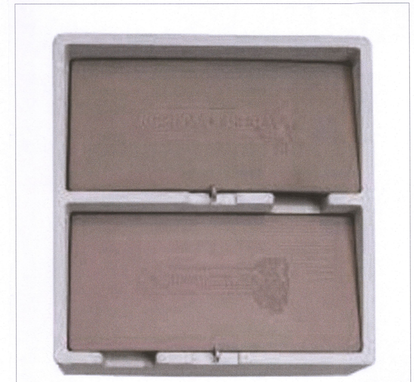
D 03 Schwegler Bat Box or similar and approved