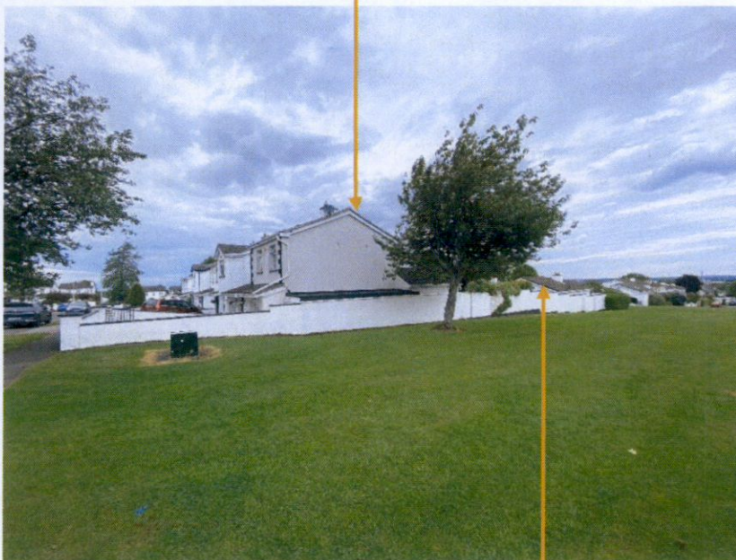
Top of ridge of Application site 32 The Dale.

Top of ridge level of No.20 Kingswood Dr. located to the rear of application site.