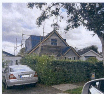
As built front view.