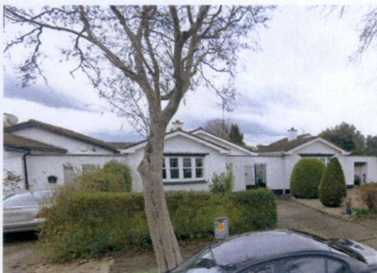
Original front view.

11 Cedar Ave, Kingswood, Dublin 24, D24 X80K