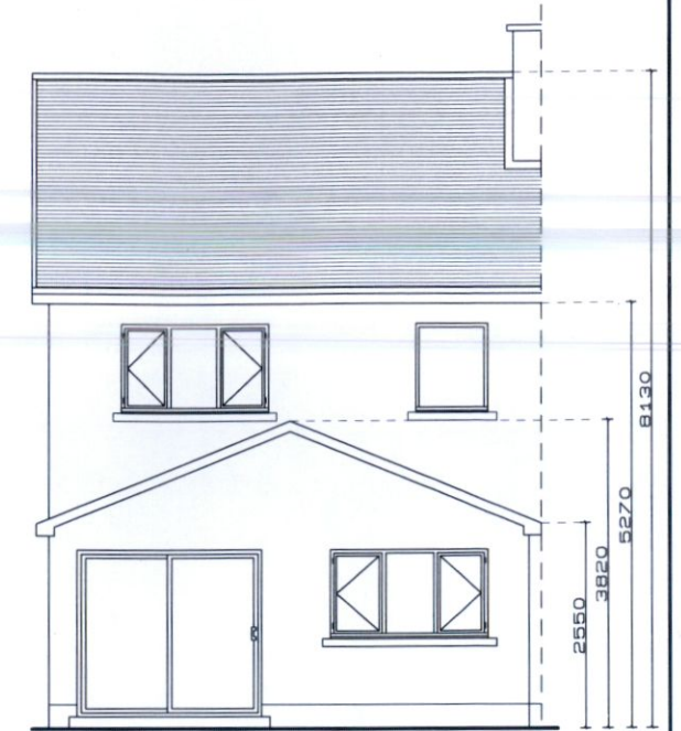
EXISTING REAR ELEVATION SCALE 1:100 @ A3