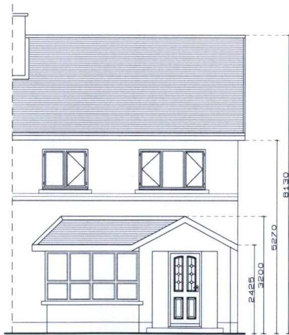
EXISTING FRONT ELEVATION SCALE 1:100 @ A3