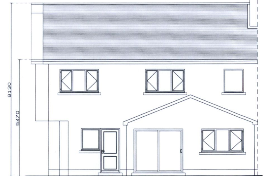
PROPOSED REAR ELEVATION SCALE 1:100 @ A3 UPDATED