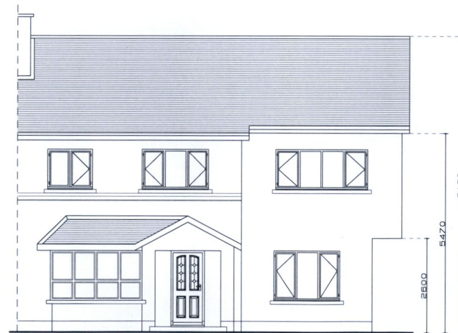
PROPOSED FRONT ELEVATION SCALE 1:100 @ A3 UPDATED