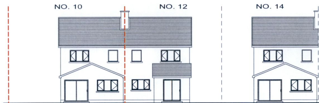
EXISTING CONTEXTUAL REAR ELEVATION SCALE 1:200@A3