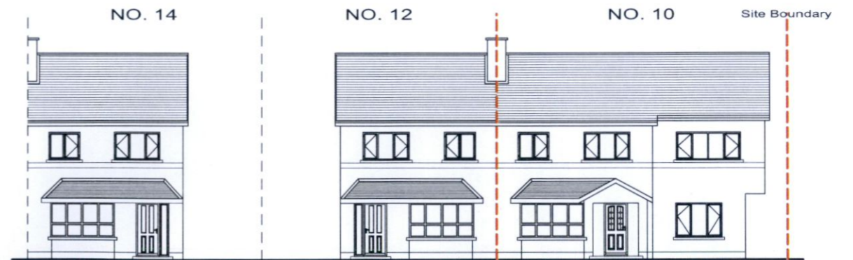
PROPOSED CONTEXTUAL FRONT ELEVATION SCALE 1:200 @ A3