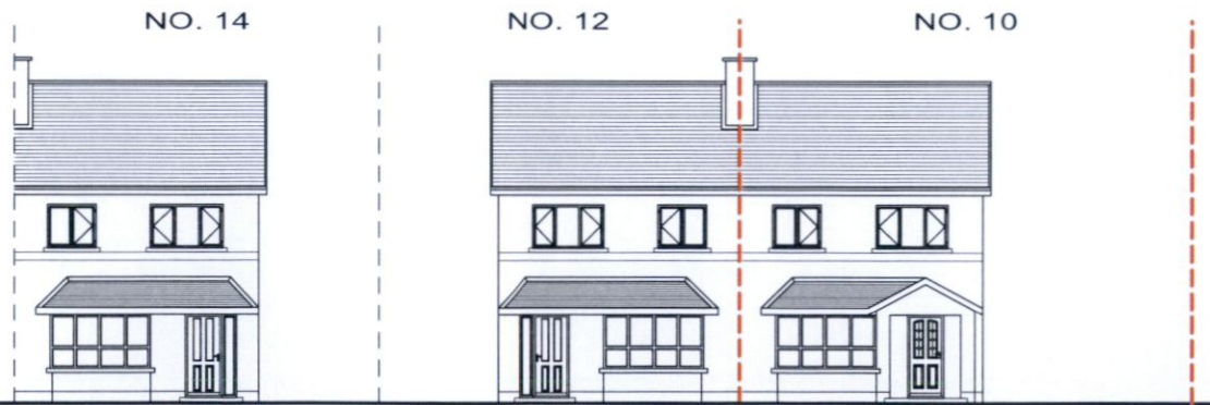
EXISTING CONTEXTUAL FRONT ELEVATION SCALE 1:200 @ A3