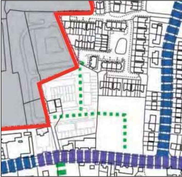
Figure 3 Road's layout from LAP 2012

The pedestrian link to the east of the development is described as “potential” in the submission the applicant should confirm if this link is to be provided. If the link is to be provided, then the applicant should ensure a footpath is provided to the back of the parking spaces.