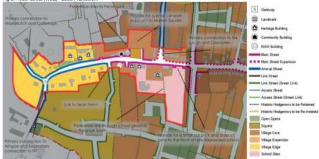
Fig 6.4 Main Street (West) - Local Framework