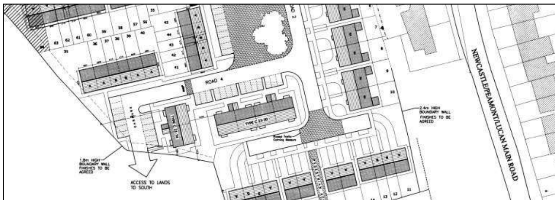
Figure 1 road layout from SD00A/0919

The development has 2.0m wide footpaths throughout. The main link street has provided for on street parking but does not provide cycle facilities, the applicant should demonstrate separate cycling provision as per the most up to date cycle manual and provide any connections for the Cycle South Dublin project in the area.