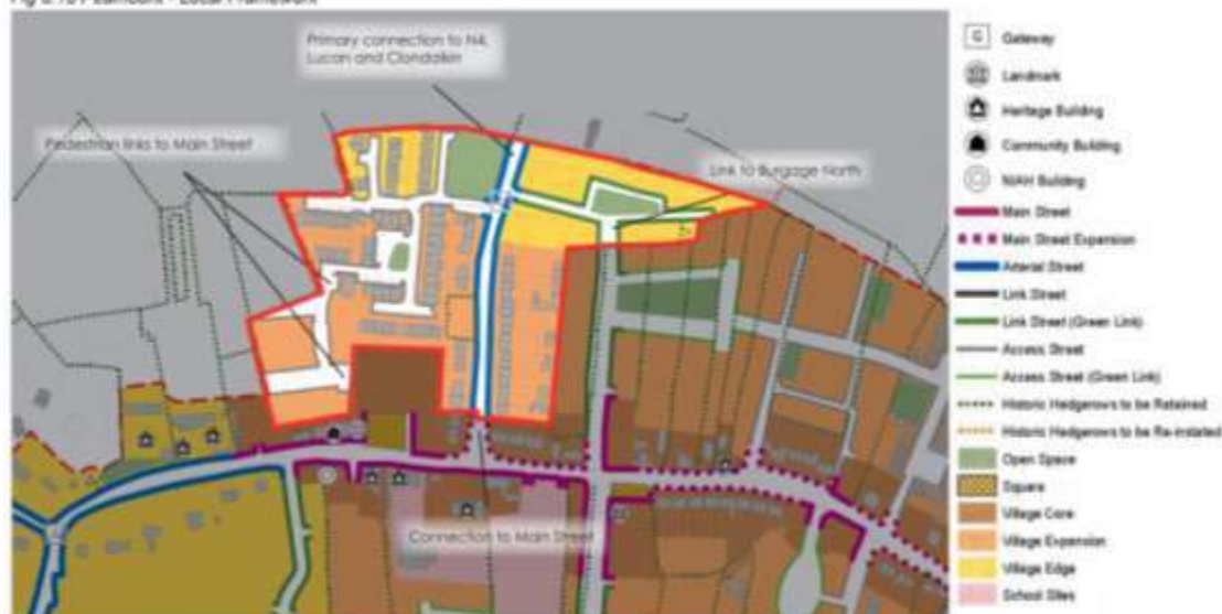
Fig 6.18 Peamount - Local Framework

Development within the Plan Lands shall adhere to the qualitative and quantitative standards and urban design criteria set out under this Plan. (Objective SC1)