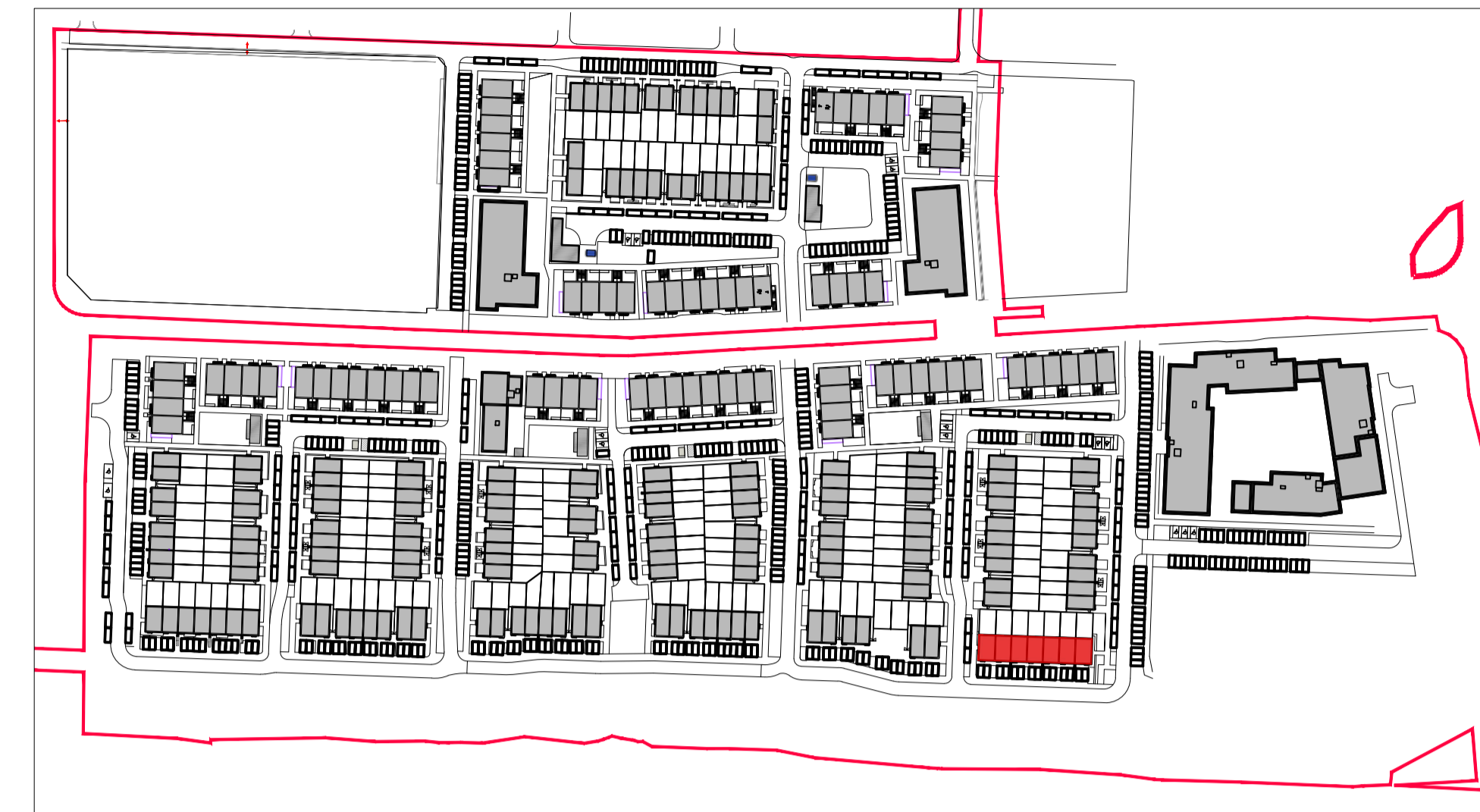
1 KEY PLAN NTS