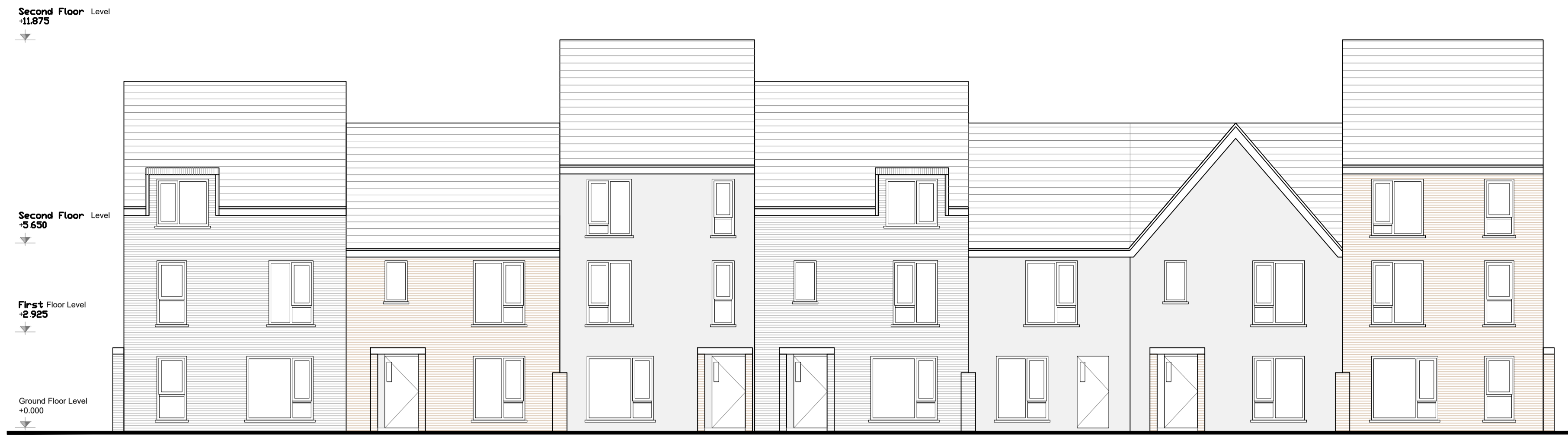
1 Type H3s 2 Type H1 3 Type H4 4 Type H3 5 Type H2 6 Type H1 7 Type H4s FRONT ELEVATION