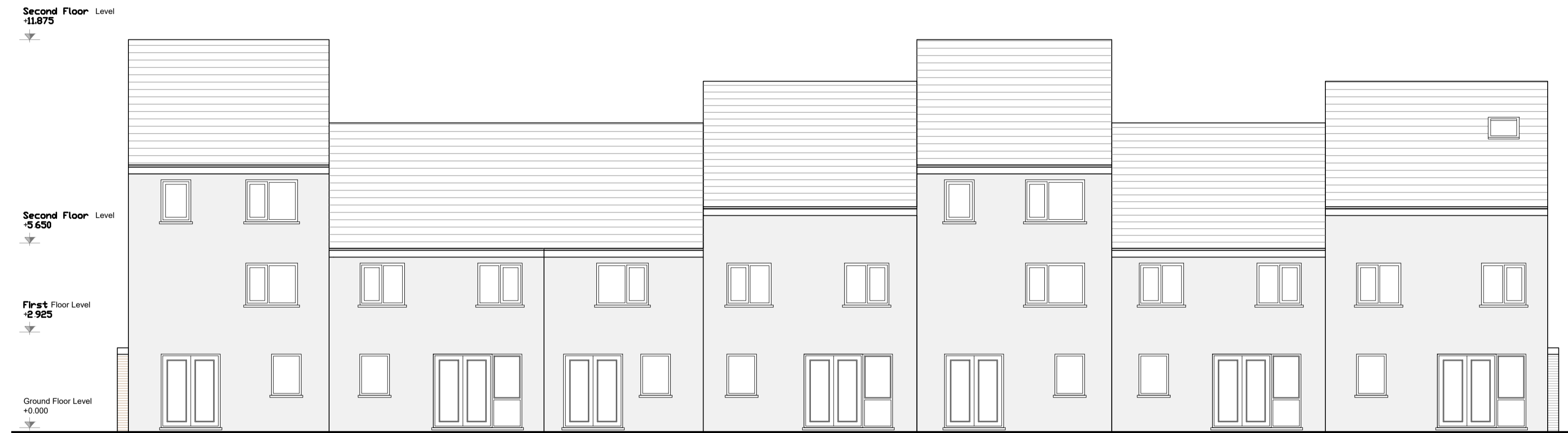
7 Type H4s 6 Type H1 5 Type H2 4 Type H3 3 Type H4 2 Type H1 1 Type H3s REAR ELEVATION