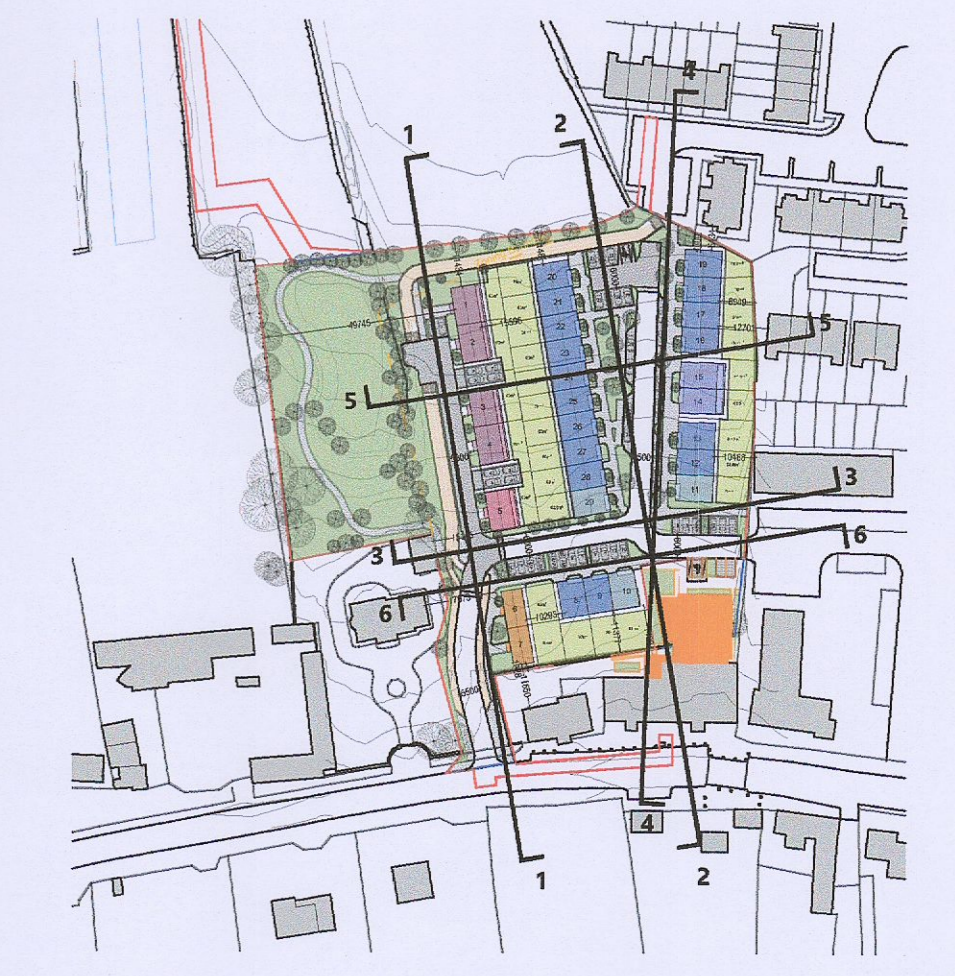
KEY PLAN NOT TO SCALE

*NOTE HOUSE NO. 1 - 7 HAVE NO OPPOSING REAR WINDOWS. PLEASE REFER TO DESIGN STATEMENT FOR MORE INFORMATION.