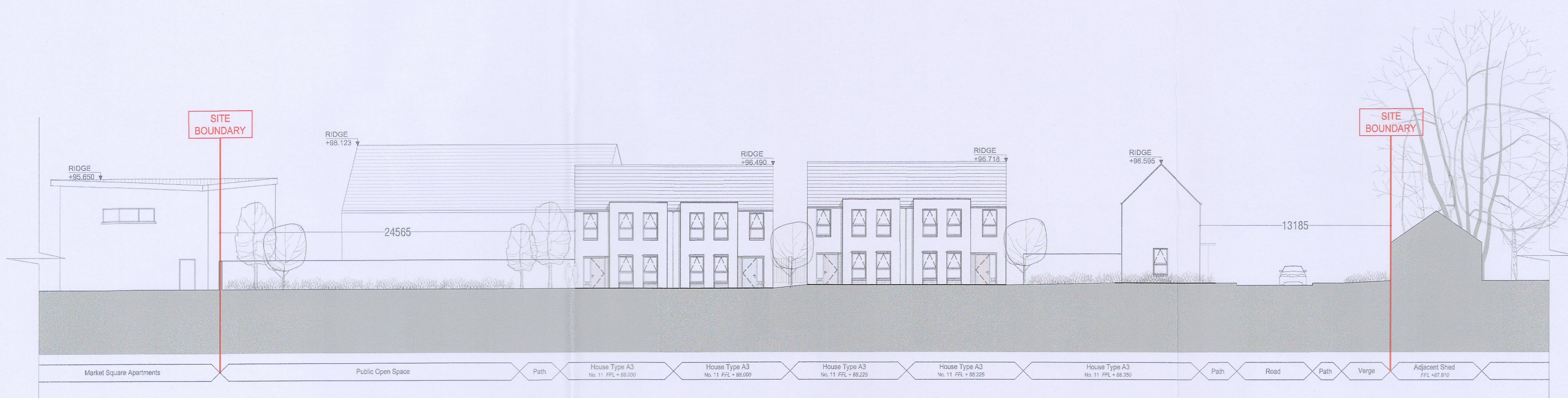
Contiguous Elevation - View 6-6