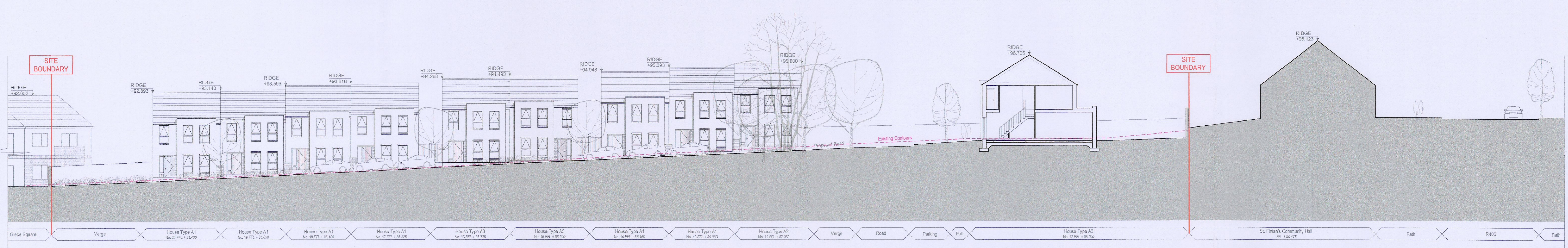
Contiguous Elevation - View 4-4