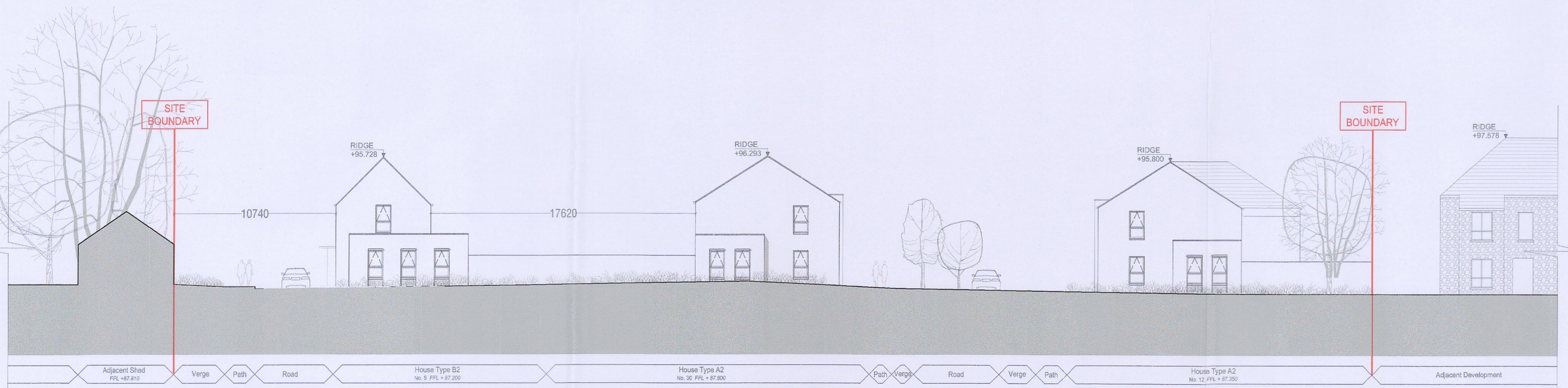
Contiguous Elevation - View 3-3

NOTE REFER TO CS CONSULTING DRAWINGS FOR DETAILED LEVELS PROPOSED