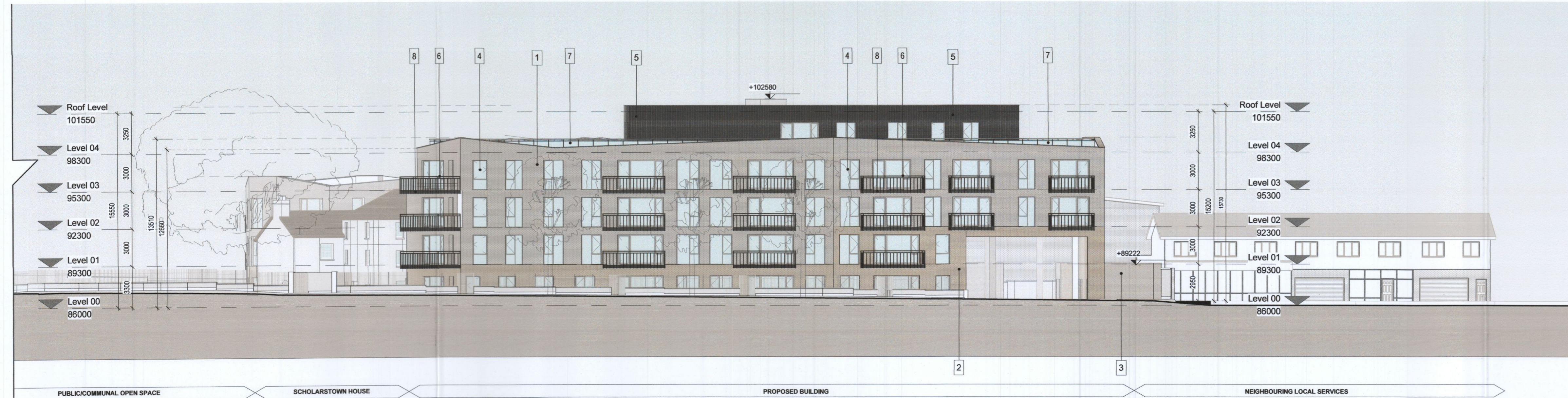
2 PROPOSED CONTEXTUAL ELEVATION 2-CONTINUED