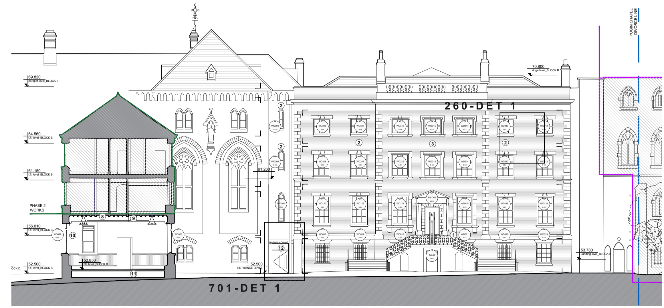
KEY ELEVATION - CALL OUT- 1:200