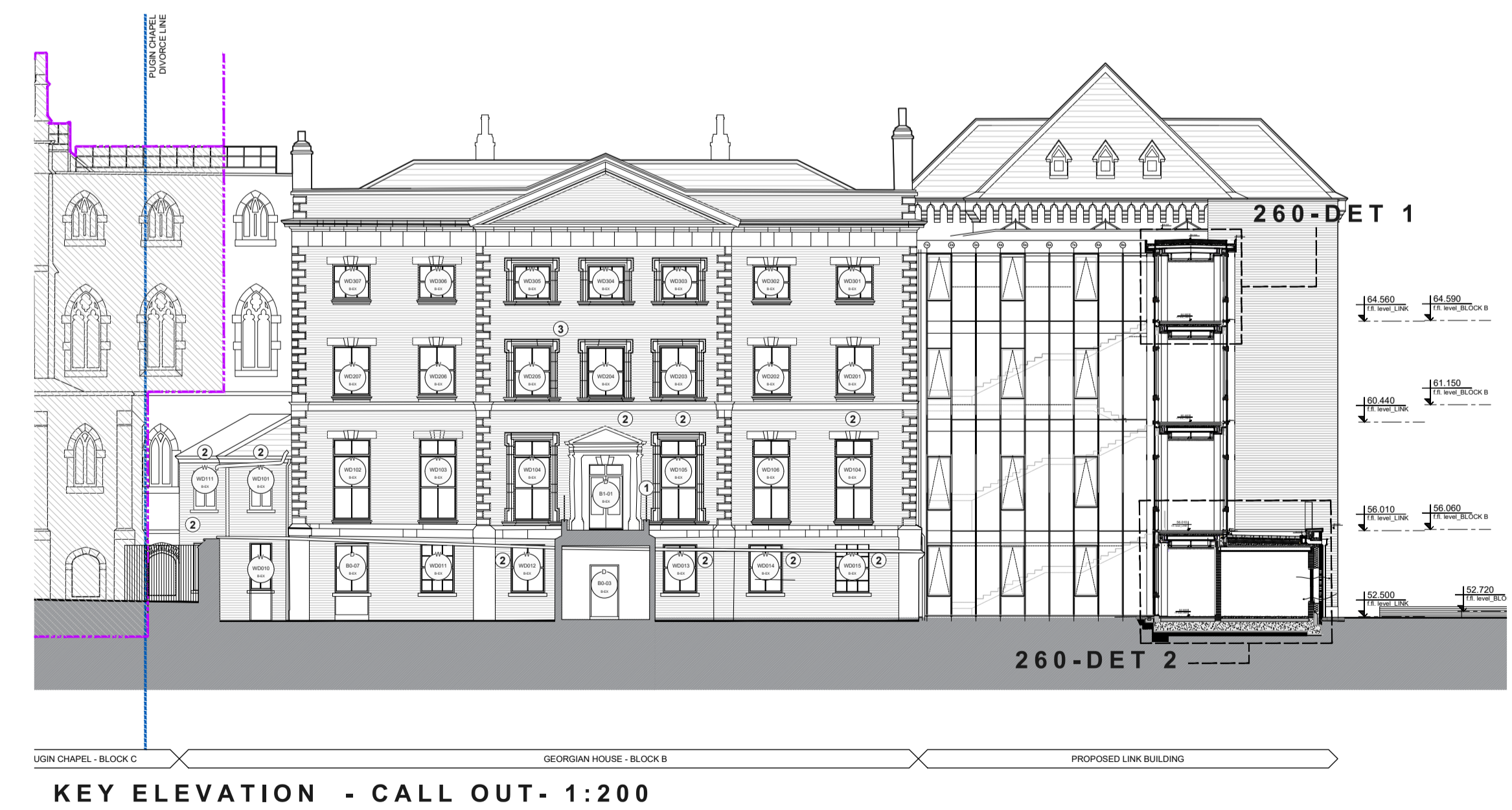
KEY ELEVATION - CALL OUT - 1:200

NOTE: Details provided in response to planning RFI Item 2 "The applicant is to submit detailed drawings and CGIs of the proposed glazed link, from all sides". Should planning permission be granted, details to be further developed for tender and construction stages