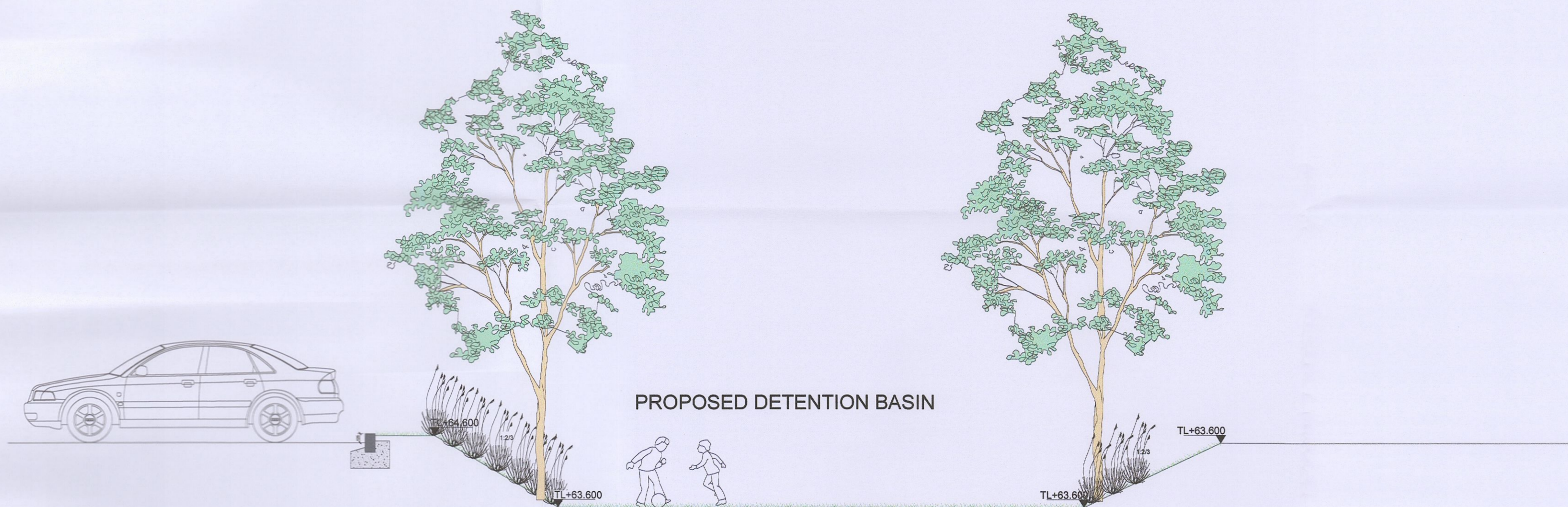
SECTION BB-14/scale 1:50