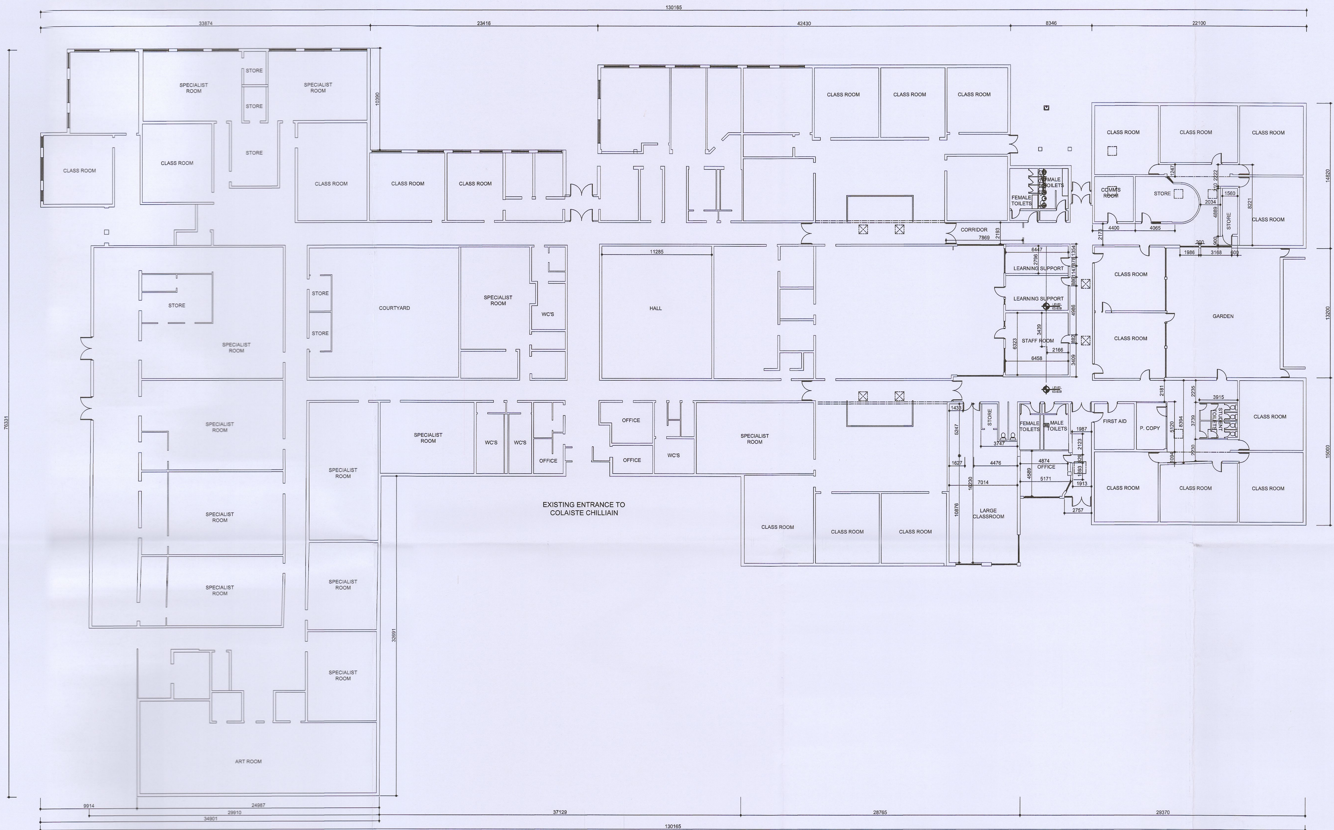
ES EXISTING FLOOR PLAN 1201 1:200 @ A1