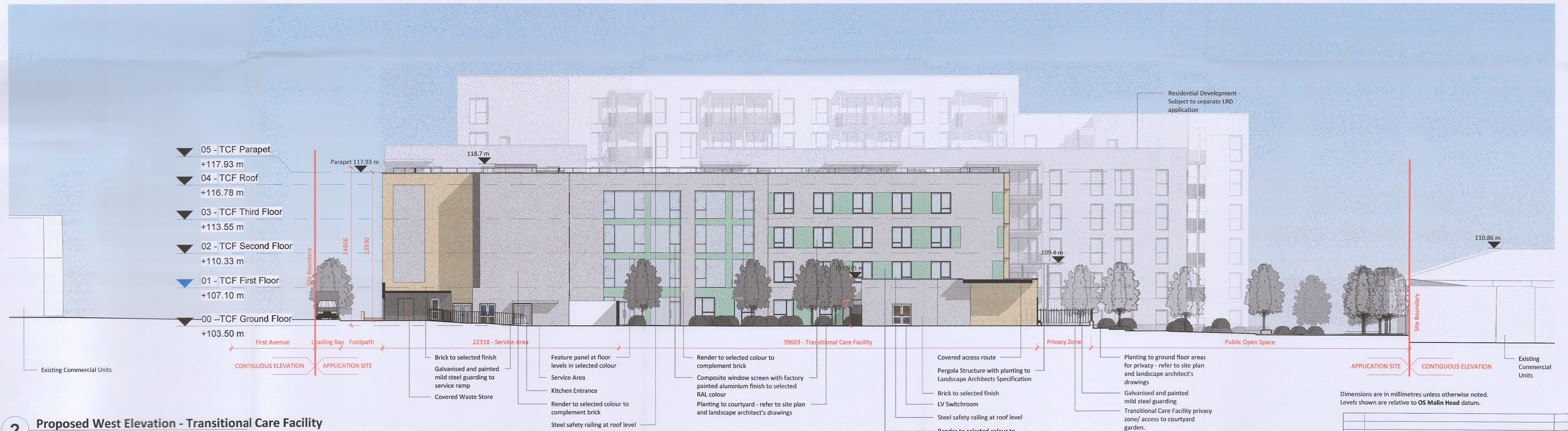
2 Proposed West Elevation - Transitional Care Facility 1:200

Dimensions are in millimetres unless otherwise noted. Levels shown are relative to OS Malin Head datum.