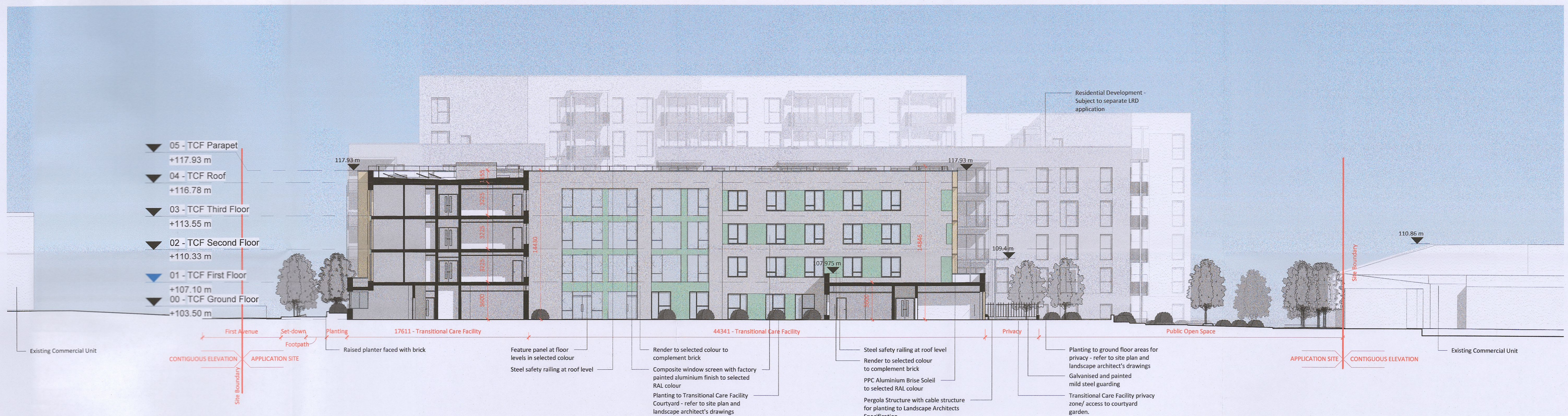
1 Proposed Section E-E - Transitional Care Facility 1:200

GENERAL NOTES: A. THIS DRAWING IS TO BE READ IN CONJUNCTION WITH ALL RELEVANT ARCHITECTURAL DRAWINGS, THE SPECIFICATION, AND ALL RELEVANT STANDARD DETAIL DRAWINGS. B. THIS DRAWING IS TO BE READ IN CONJUNCTION WITH ALL RELEVANT CIVIL, STRUCTURAL, MECHANICAL AND ELECTRICAL DRAWINGS TOGETHER WITH THE SPECIFICATIONS AND SCHEDULES. C. ALL DIMENSIONS IN MILLIMETRES. DO NOT SCALE FROM THIS DRAWING. USE FIGURED DIMENSIONS ONLY. D. CONTRACTOR MUST VERIFY ALL DIMENSIONS ON SITE BEFORE SETTING OUT, COMMENCING WORK, OR PRODUCING ANY SHOP DRAWINGS.