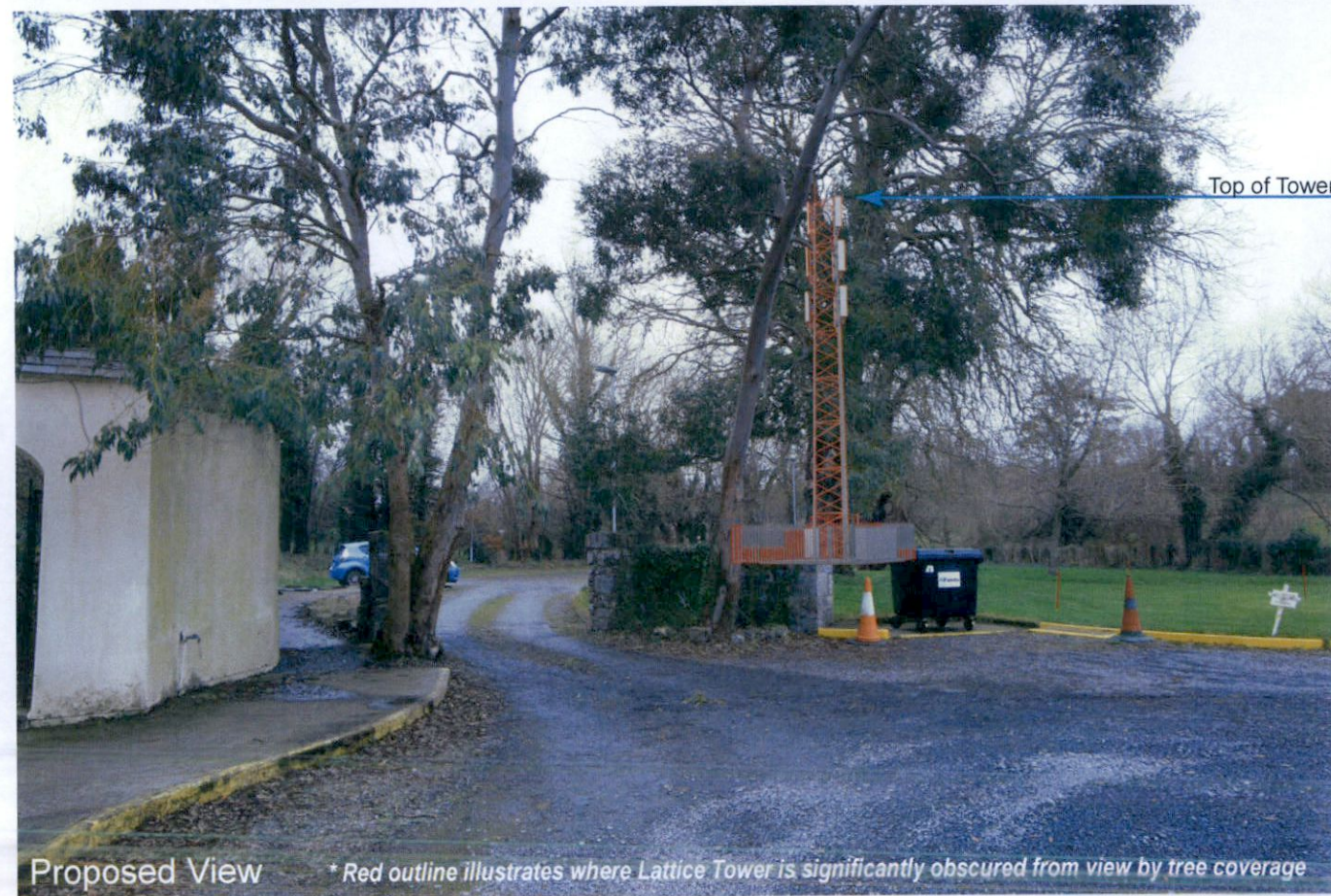
Proposed View * Red outline illustrates where Lattice Tower is significantly obscured from view by tree coverage