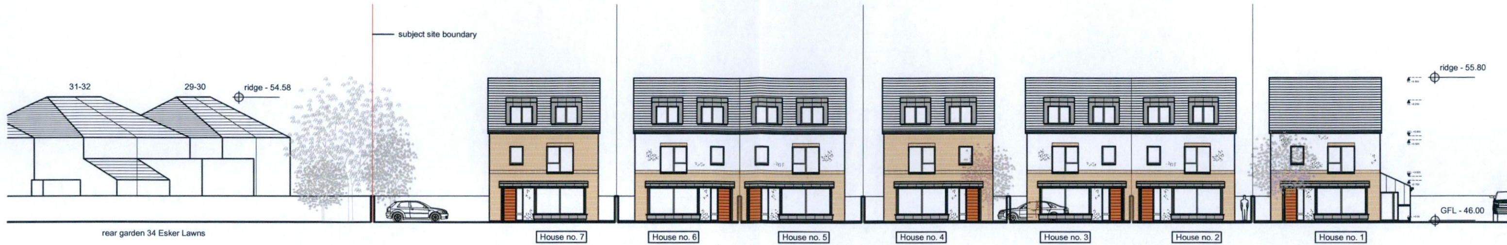
NORTH ELEVATION - site section A-A units 1 to 7