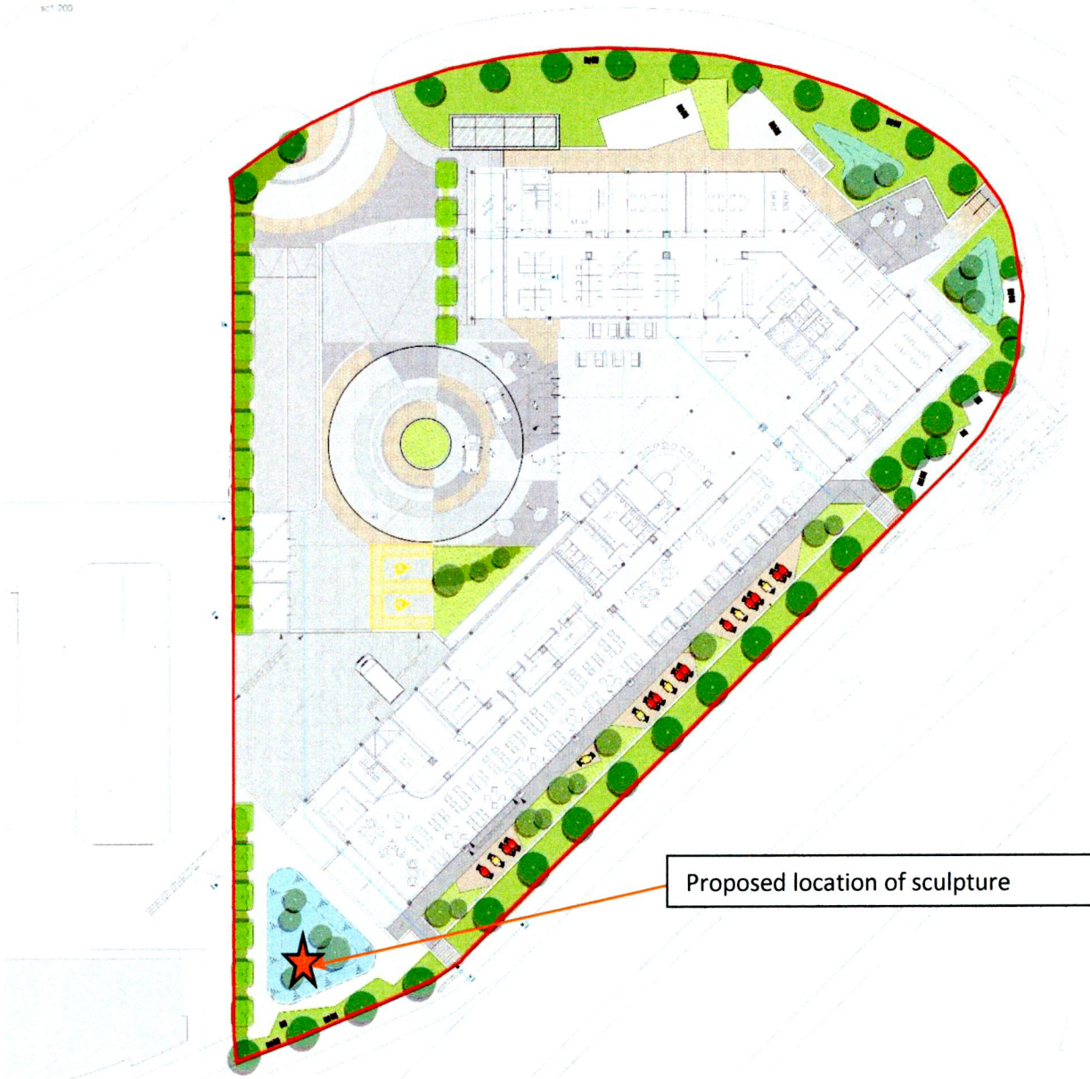
Figure E. Landscape Masterplan

LIFFEY VALLEY HOTEL Landscape Masterplan sc1 200