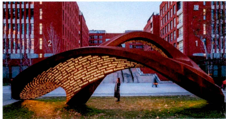
Figure C & D. Sample of sculpture.