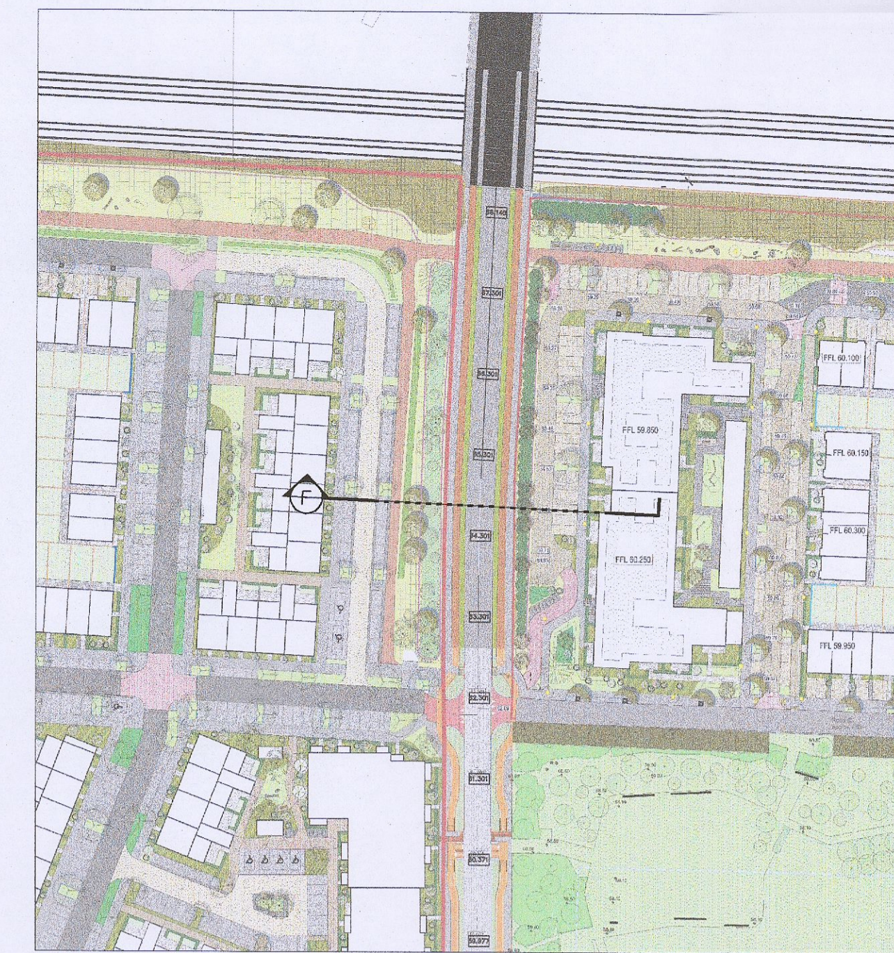
KEY PLAN NTS