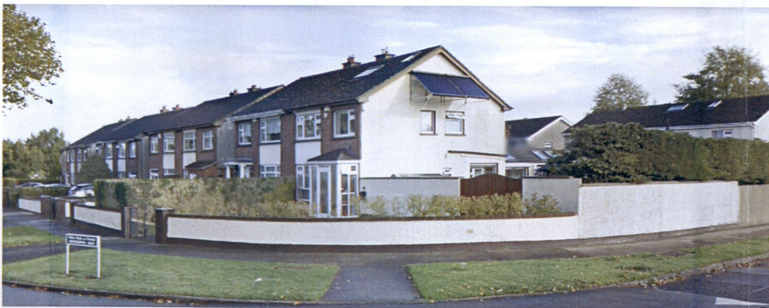
EXISTING BOUNDARY WALL - boundary wall & Hedge - on Dodsborough Road