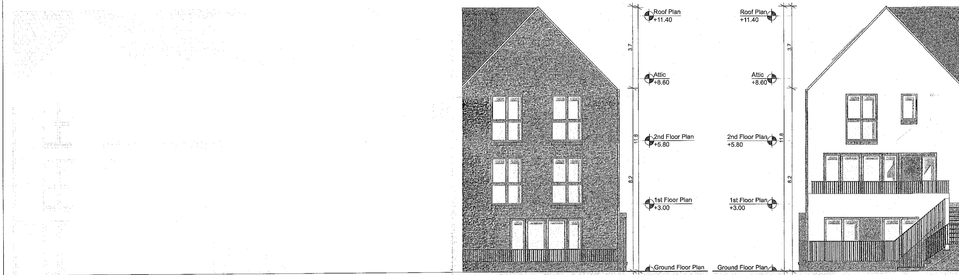
FRONT ELEVATION REAR ELEVATION