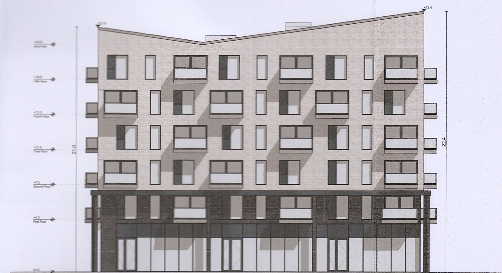
Plaza - South Elevation