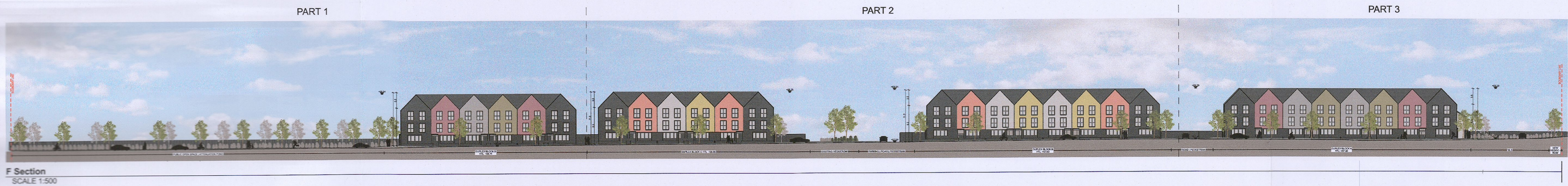
F Section SCALE 1:500