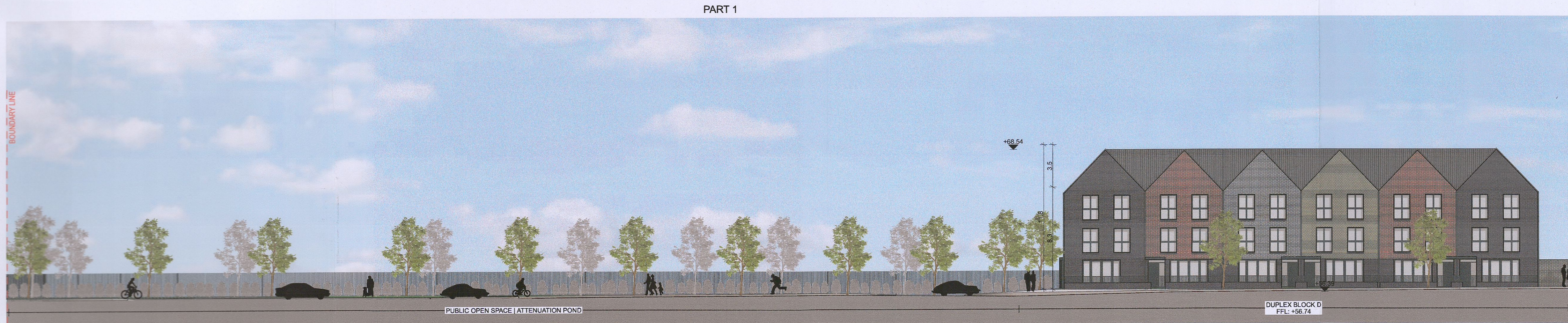
F Section SCALE 1:200