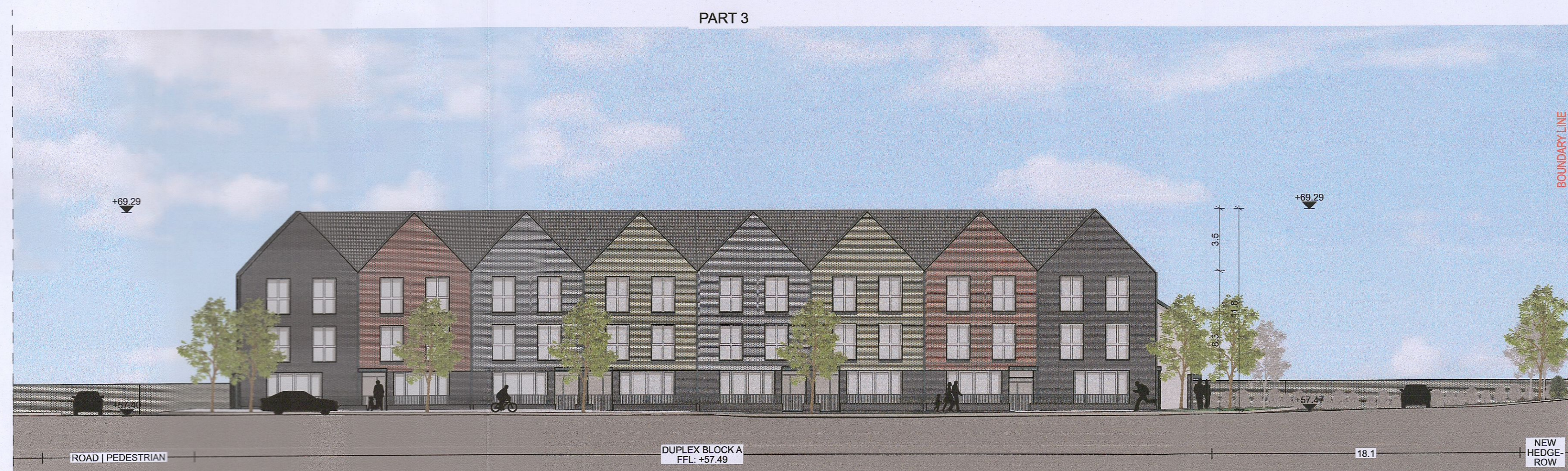
F Section SCALE 1:200