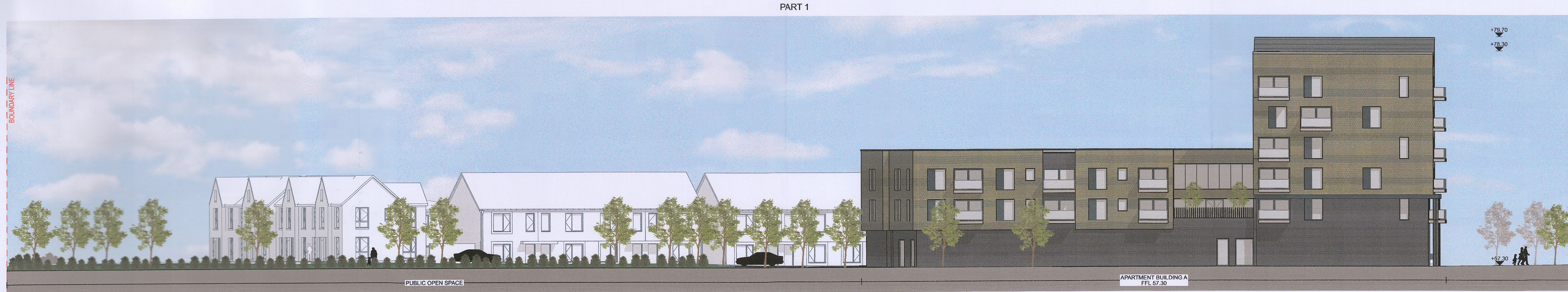
C Section SCALE 1:200