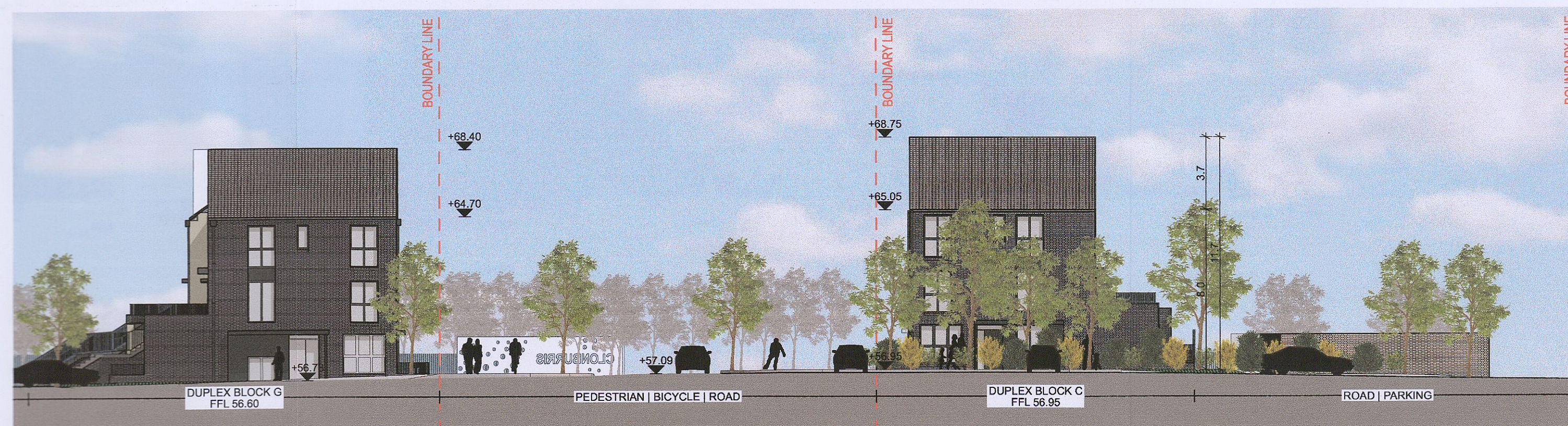
E Section SCALE 1:200