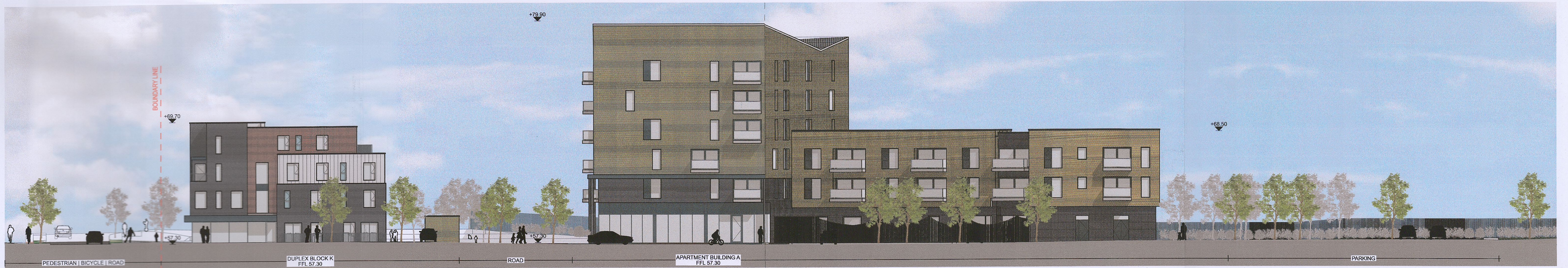
B Section SCALE 1:200