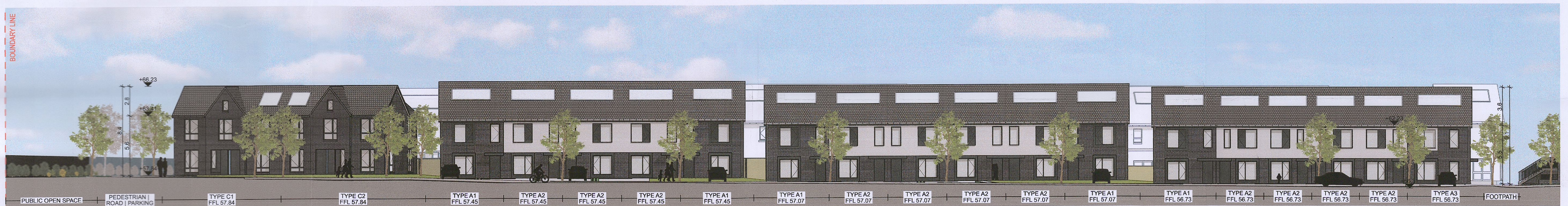
D Section SCALE 1:200