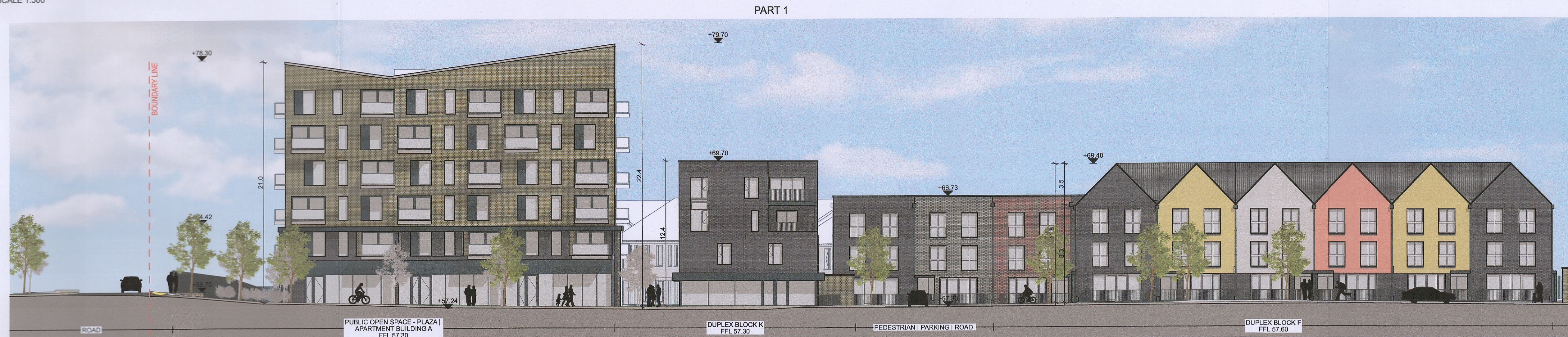
A Section SCALE 1:200