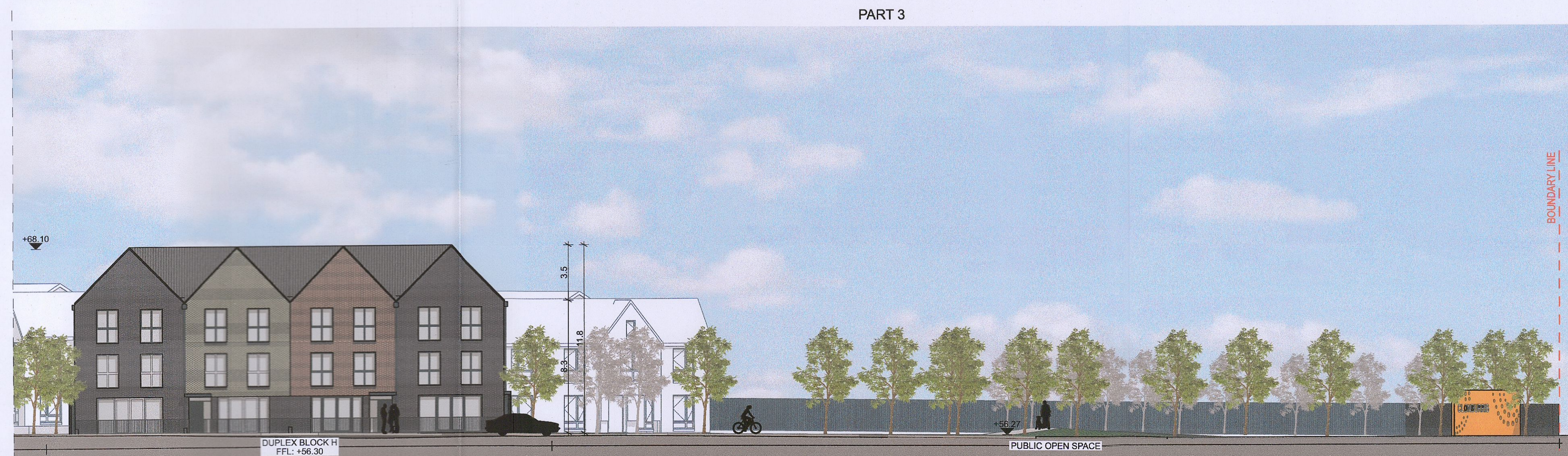
B Section SCALE 1:200