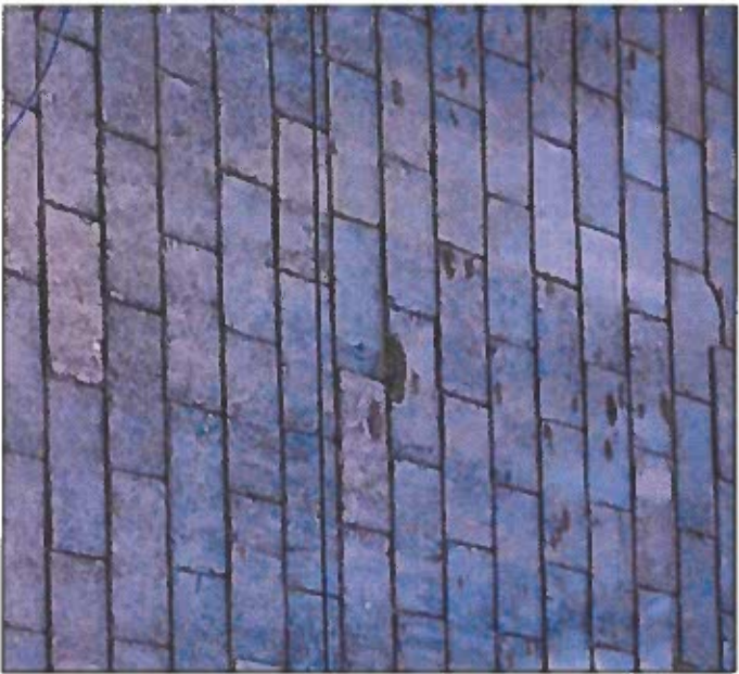
A: EXISTING NATURAL SLATE ROOF FINISH

NOTES: THE EXISTING SLATES WILL BE RETAINED WHERE POSSIBLE WITH ANY REQUIRED REPLACEMENTS SELECTED TO MATCH.