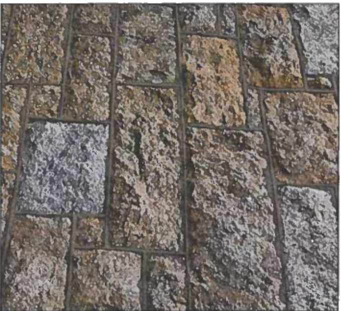
B: EXISTING GRANITE STONE FINISH

NOTES: THE EXISTING SLATES WILL BE RETAINED WHERE POSSIBLE WITH ANY REQUIRED REPLACEMENTS SELECTED TO MATCH.