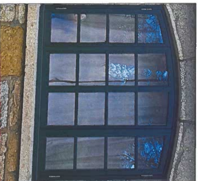
D: REPLACEMENT MULTI-PANE TIMBER CASEMENT WINDOWS

NOTES: THE EXISTING BRICKWORK CHIMNEYS TO BE REBUILT, ON SAFETY GROUNDS, WITH THE EXISTING BRICKS REINSTATED AND ANY REQUIRED REPLACEMENT SELECTED TO MATCH.