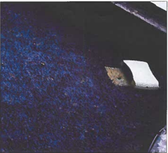
E: EXISTING RENDER FINISH

NOTES: THESE ARE TO MATCH THE HISTORIC DETAIL OF THE ORIGINAL WINDOWS, MANUFACTURED AND INSTALLED BY SPECIALIST JOINER