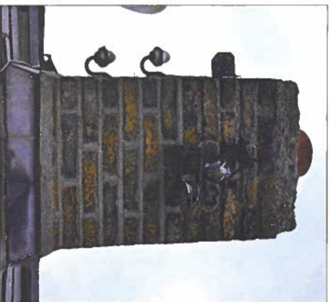
C: EXISTING BRICKWORK

NOTES: THE EXISTING GRANITE STONE WILL BE CLEANED WITH ANY MISSING GROUTING REPLACED IF NECESSARY.