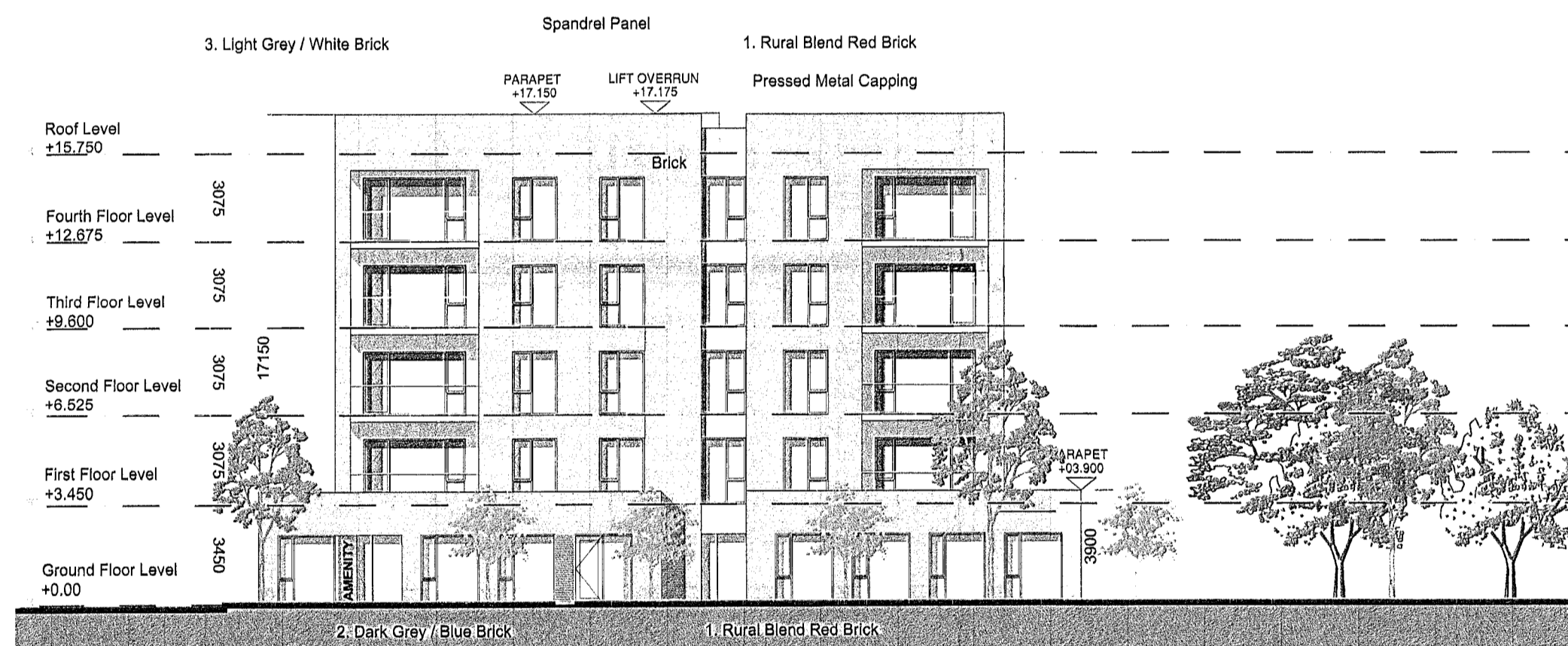
03 - SOUTH ELEVATION