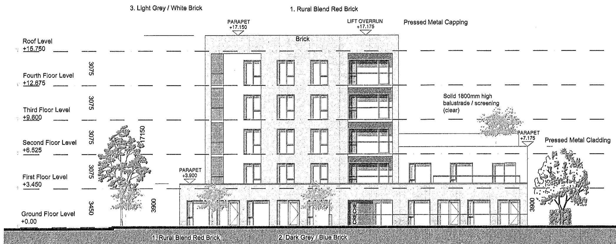
01 - EAST ELEVATION