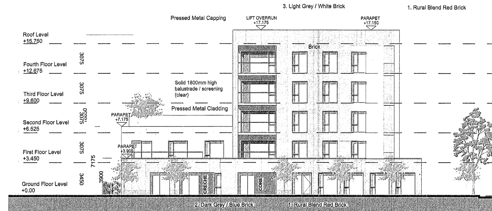
02 - WEST ELEVATION