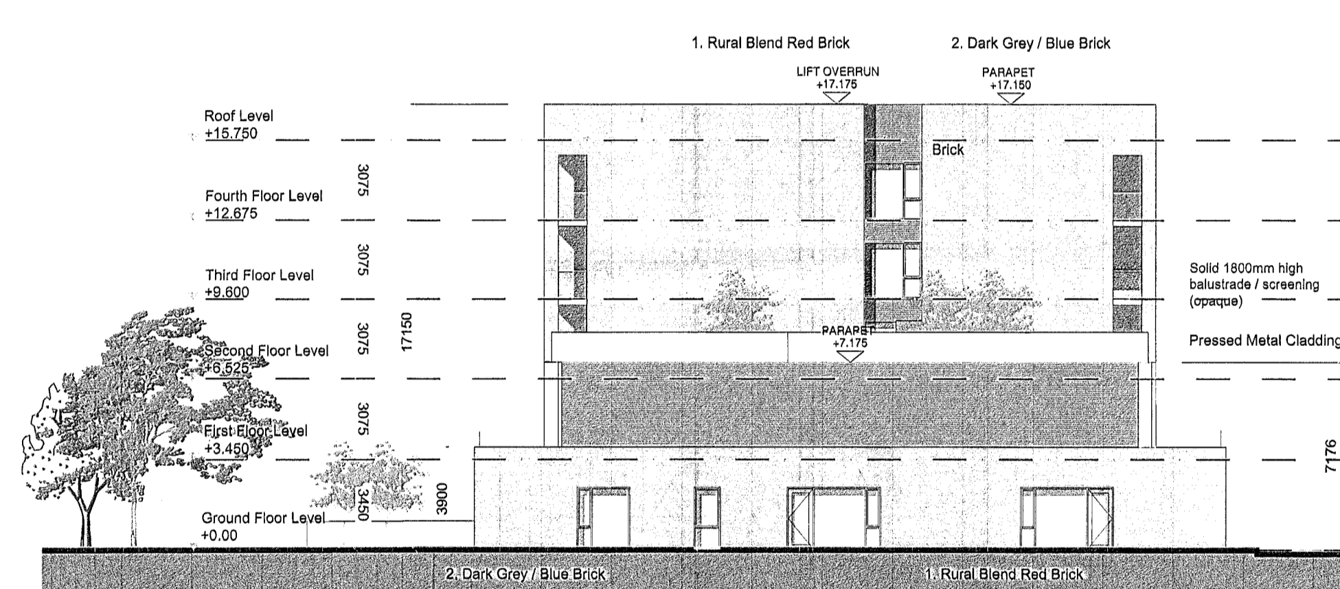
04 - NORTH ELEVATION