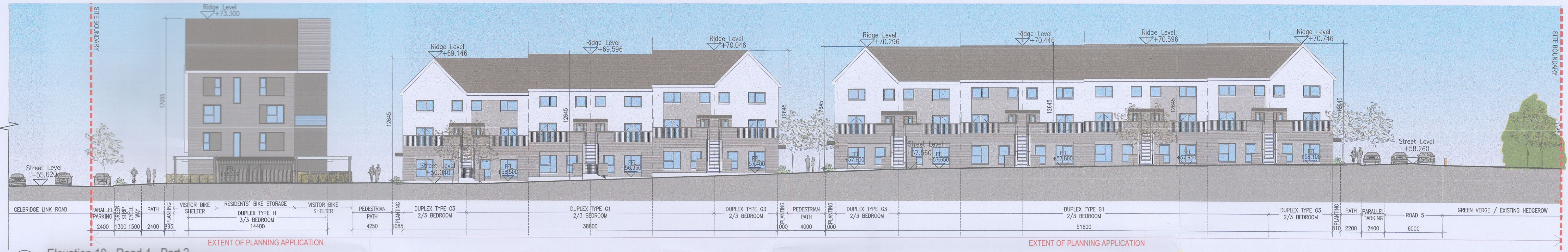
10-B P025 1:200 @ A1