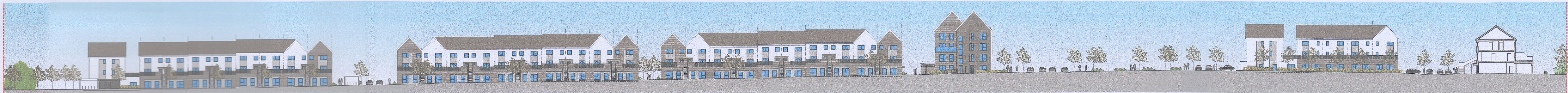
04 Elevation 04- Road 1 P022 1:500 @ A1