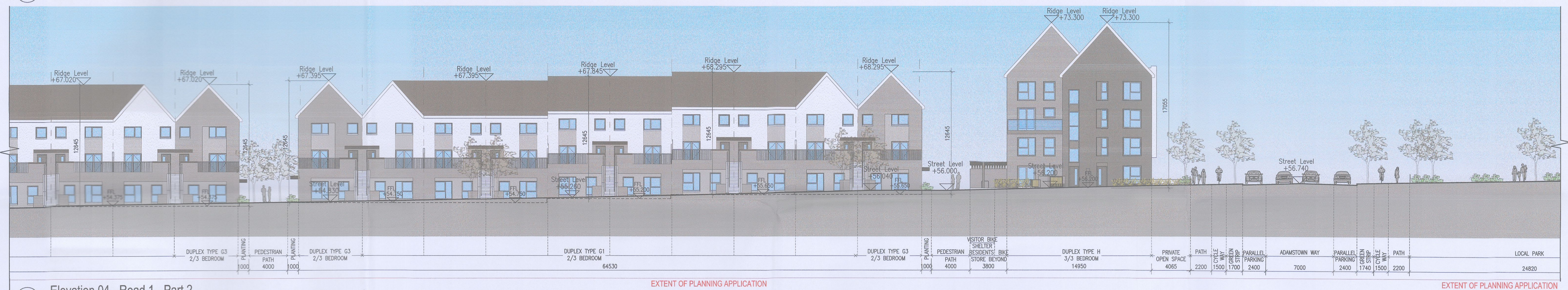
04-B Elevation 04 - Road 1 - Part 2 P022 1:200 @ A1