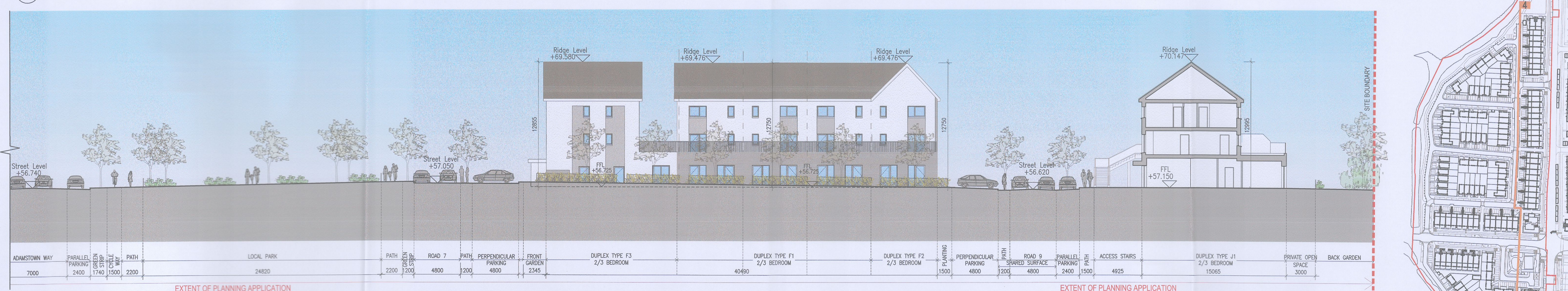
04-C Elevation 04 - Road 1 - Part 3 P022 1:200 @ A1