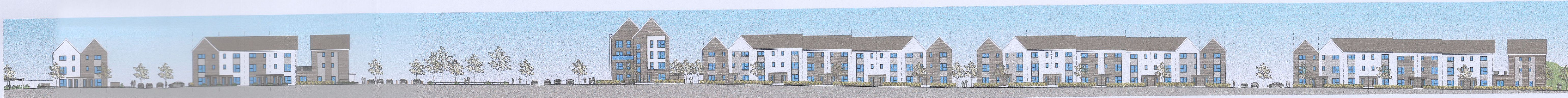
01 Elevation 01 - Celbridge Link Road 1:500 @ A1