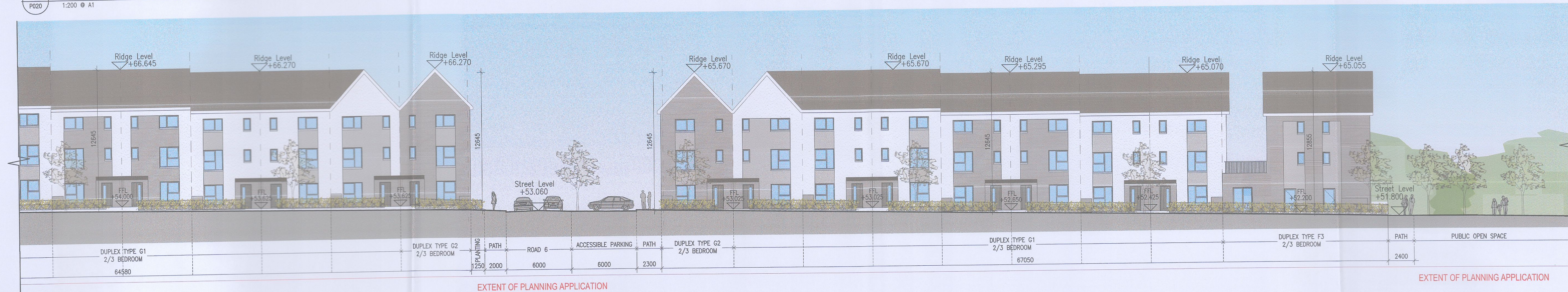
01-C Elevation 01 - Celbridge Link Road - Part 3 1:200 @ A1