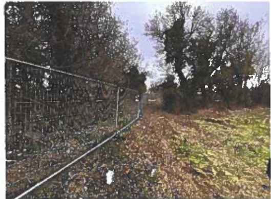
bb803c58-d353-4919-9680-8d374b5ddf44.png Taken on Jan 23, 2023 12:17 PM Added on Jan 23, 2023 1:49 PM