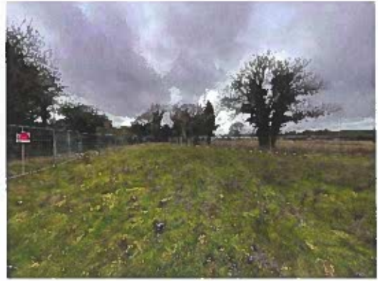
d1332e9b-ff92-4173-b6c2-4579d508bc4e.png Taken on Jan 23, 2023 12:10 PM Added on Jan 23, 2023 1:49 PM