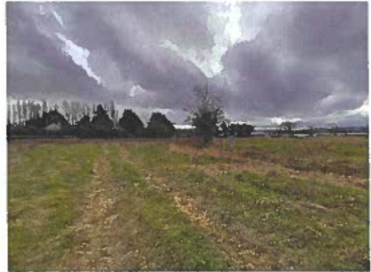
f13f0b26-ced8-4688-b6a0-2c847dea3cde.png Taken on Jan 23, 2023 12:08 PM Added on Jan 23, 2023 1:49 PM