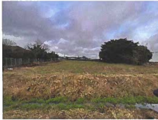
6e220c53-20e1-4af8-9428-ae35c178c765.png Taken on Jan 23, 2023 12:05 PM Added on Jan 23, 2023 1:49 PM