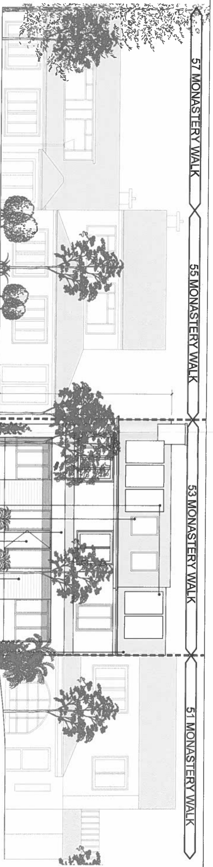
PROPOSED CONTIGUOUS (WEST) FRONT ELEVATION SCALE 1:100