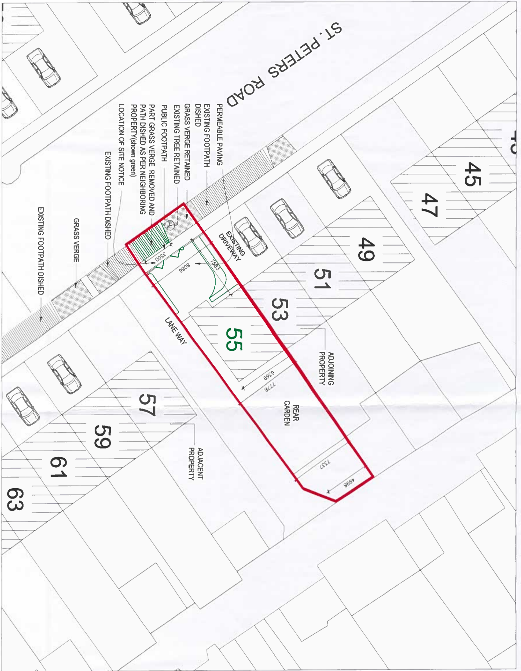
SITE LAYOUT PLAN SCALE 1:250

Adele Maguire 55 ST. PETERS ROAD, WALKINSTOWN, DUBLIN 12 D12E2X7