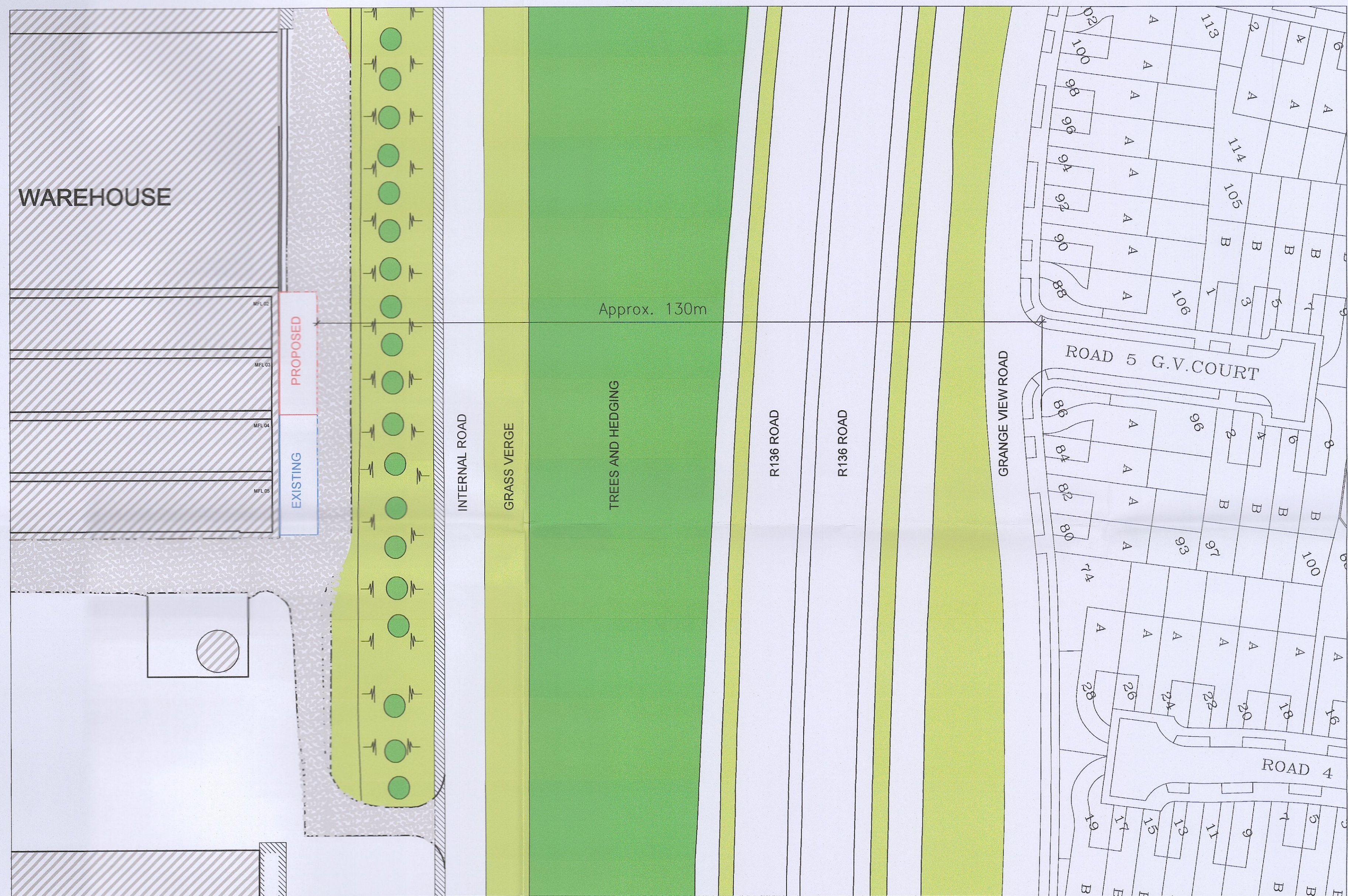
GANTRY PLATFORM PROXIMITY TO DWELLINGS SCALE 1:500

NO PART OF THIS DRAWING MAY BE REPRODUCED OR TRANSMITTED IN ANY FORM OR STORED IN ANY RETRIEVAL SYSTEM OF ANY NATURE WITHOUT THE WRITTEN PERMISSION OF MALONE O'REGAN CONSULTING ENGINEERS AS COPYRIGHT HOLDER EXCEPT AS AGREED FOR USE ON THE PROJECT FOR WHICH THE DRAWING WAS ORIGINALLY CREATED. THIS DRAWING TO BE READ IN CONJUNCTION WITH ALL OTHER RELEVANT DRAWINGS, SPECIFICATIONS AND THE PRELIMINARY HEALTH & SAFETY PLAN. ALL DIMENSIONS ARE IN mm UNLESS NOTED OTHERWISE. DO NOT SCALE DIMENSIONS. THE CONTRACTOR SHALL CHECK ALL DIMENSIONS PRIOR TO THE COMMENCEMENT OF CONSTRUCTION. ALL DISCREPANCIES SHALL BE REPORTED TO THIS OFFICE IN WRITING. NOTES