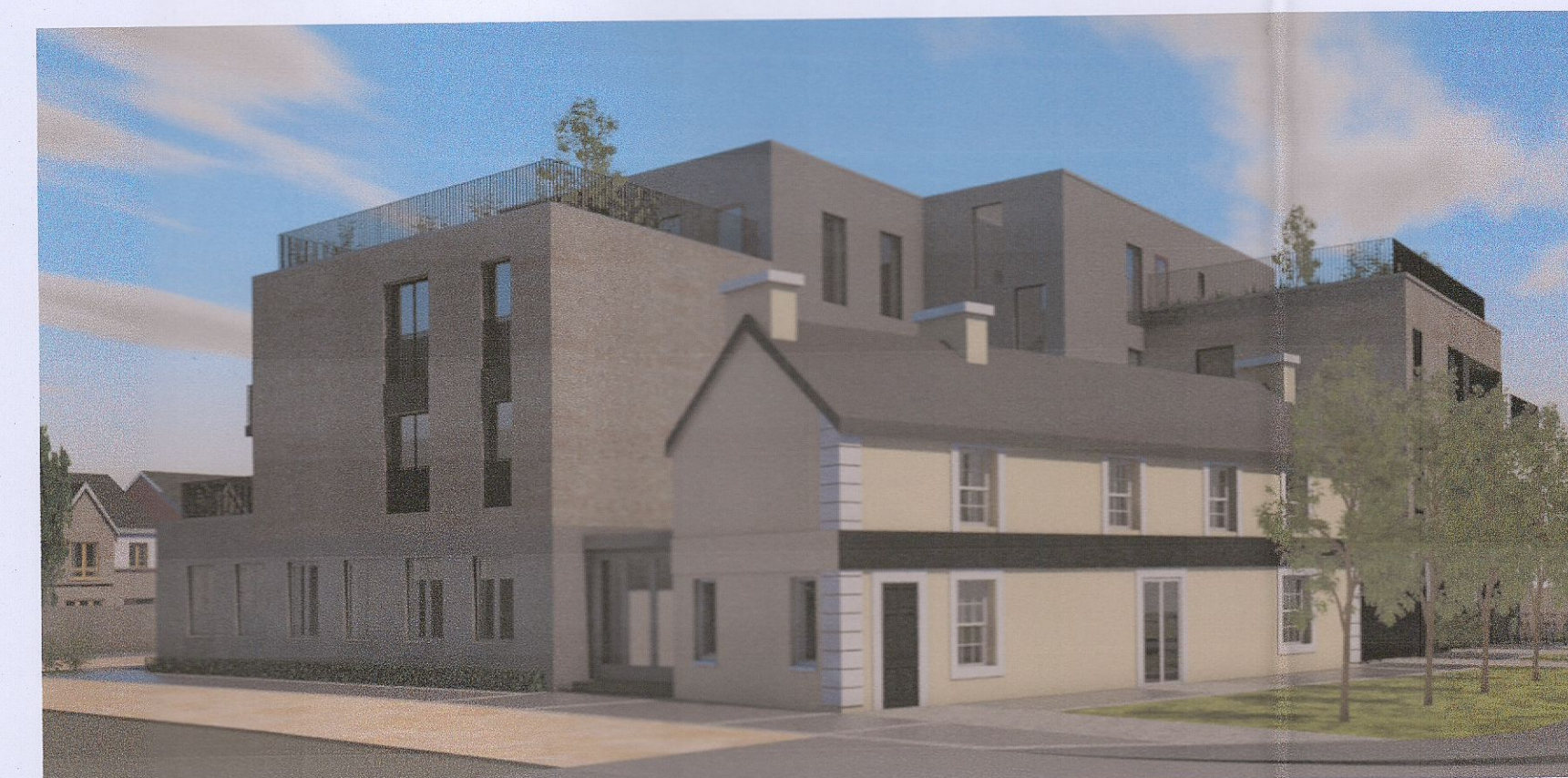
Proposed 3D view from Greenhills Road