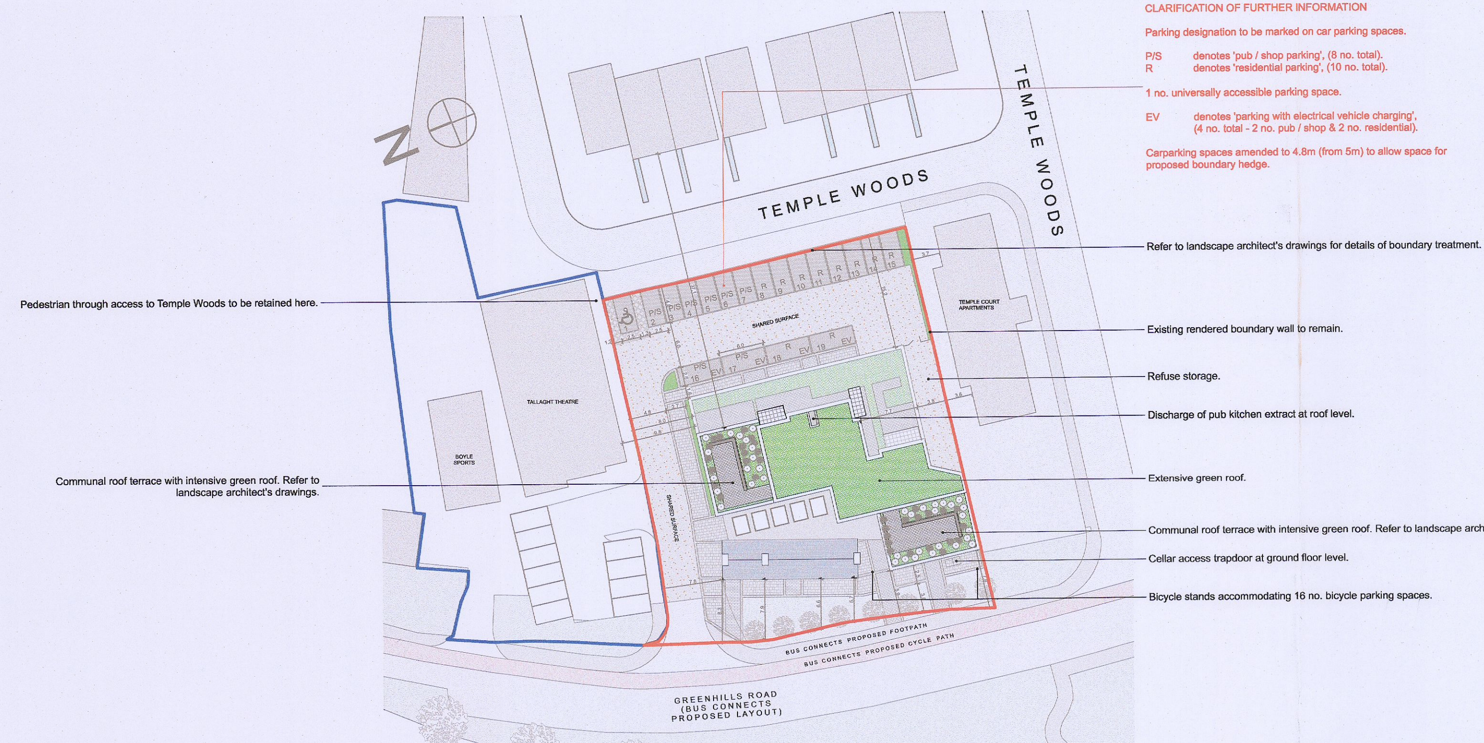
1:500 Proposed Site Plan - BusConnects road layout