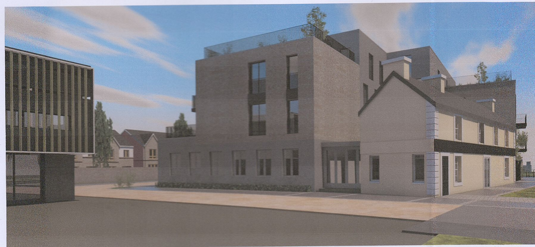
Proposed 3D view from Tallaght Theatre car park