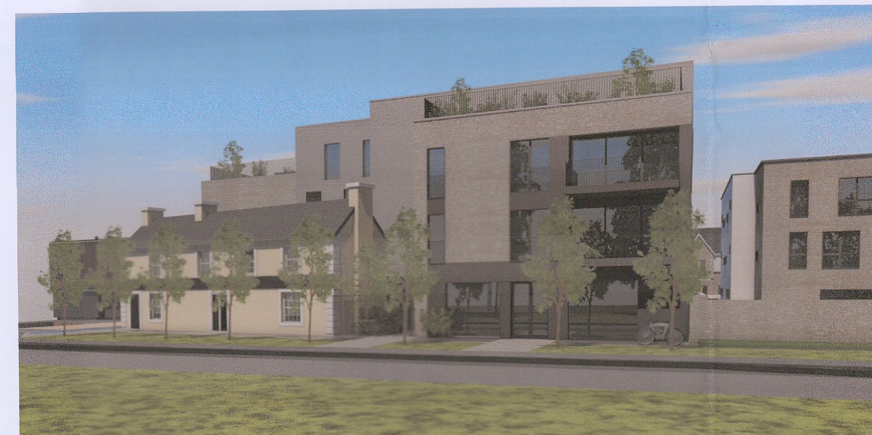
Proposed 3D view from Greenhills Road