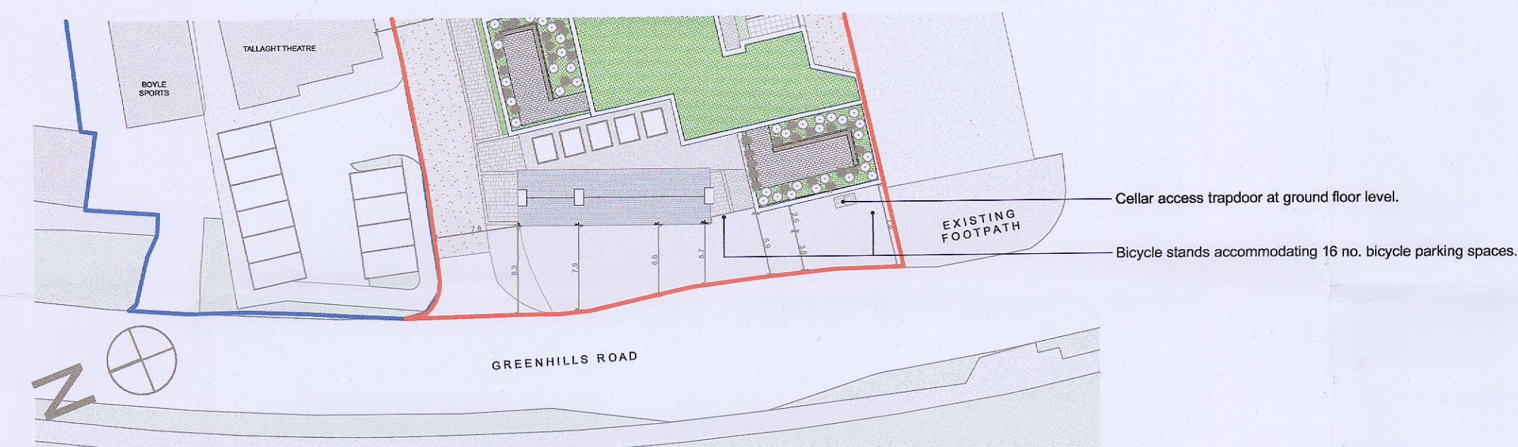
1:500 Proposed Site Plan extract - existing road layout