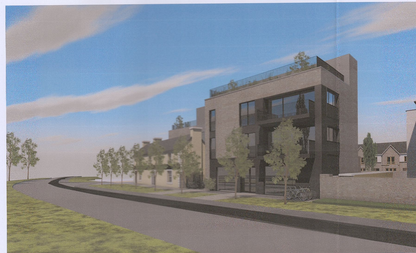
Proposed 3D view from Greenhills Road