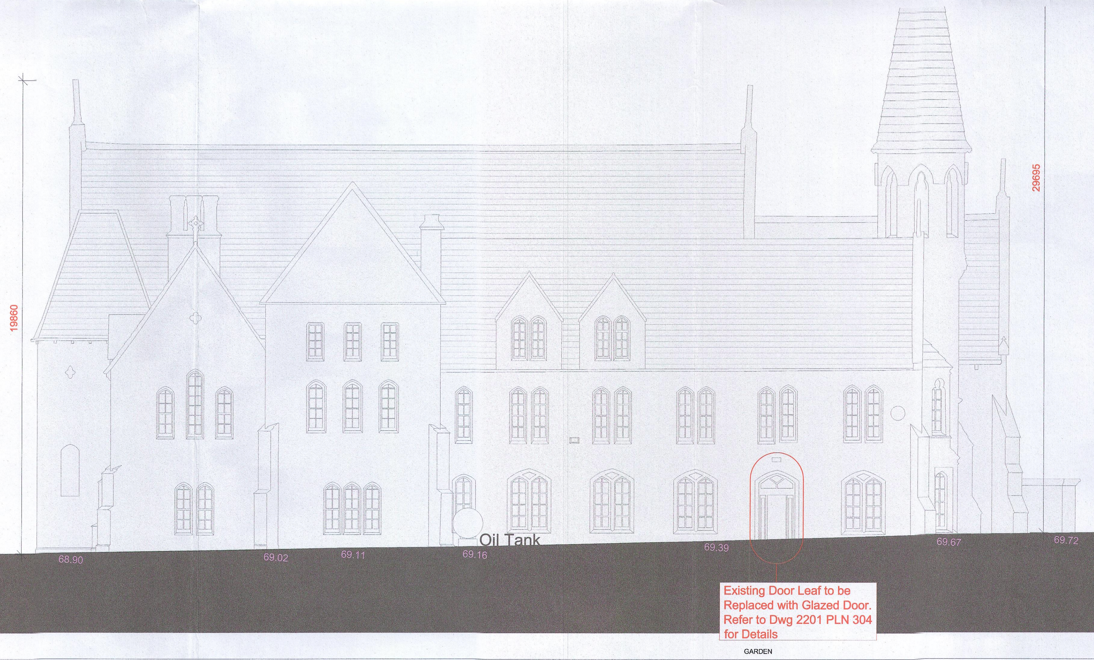
Elevation-03 Scale 1:100

Existing Door Leaf to be Replaced with Glazed Door. Refer to Dwg 2201 PLN 304 for Details