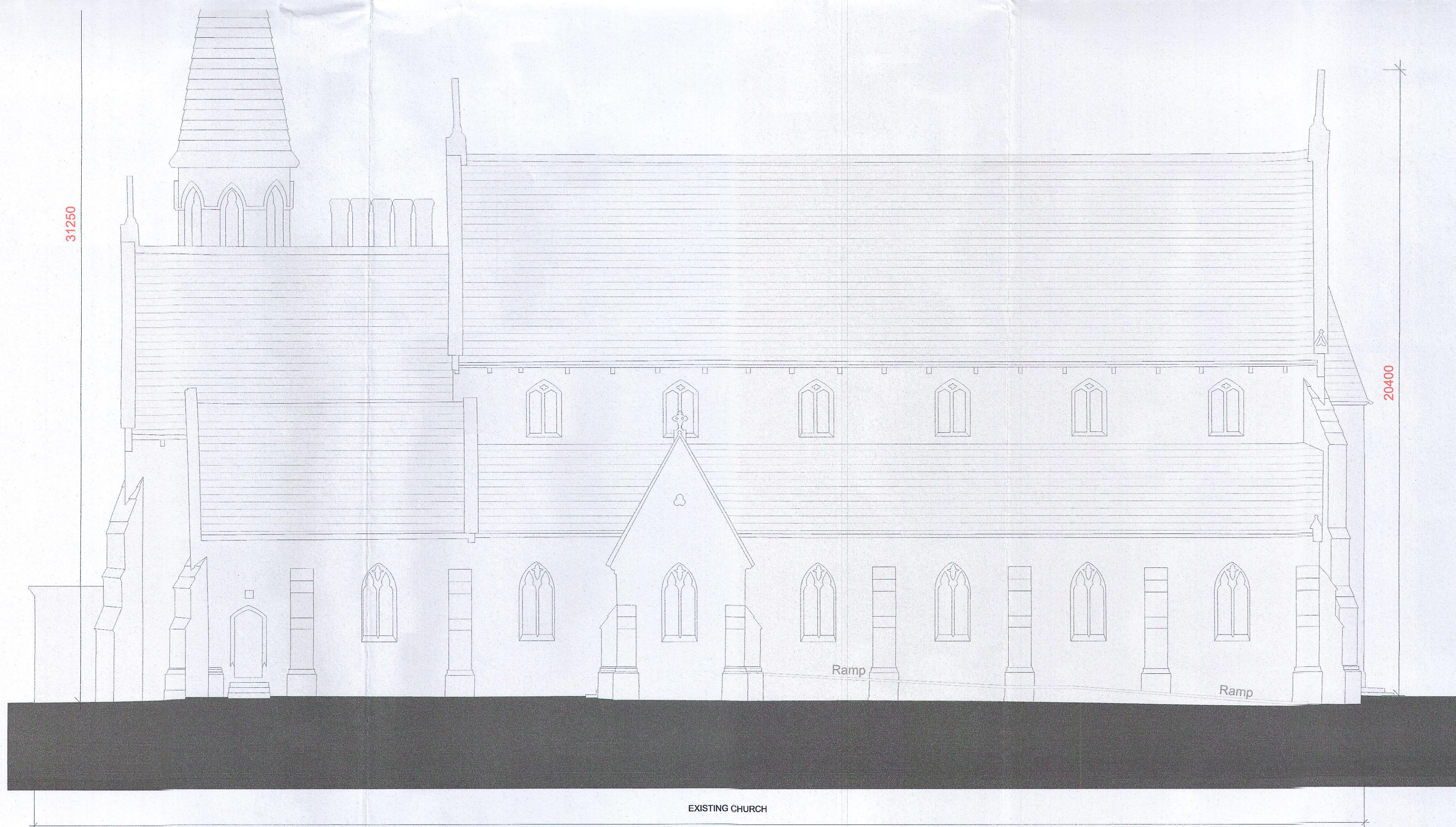
Elevation-02 Scale 1:100