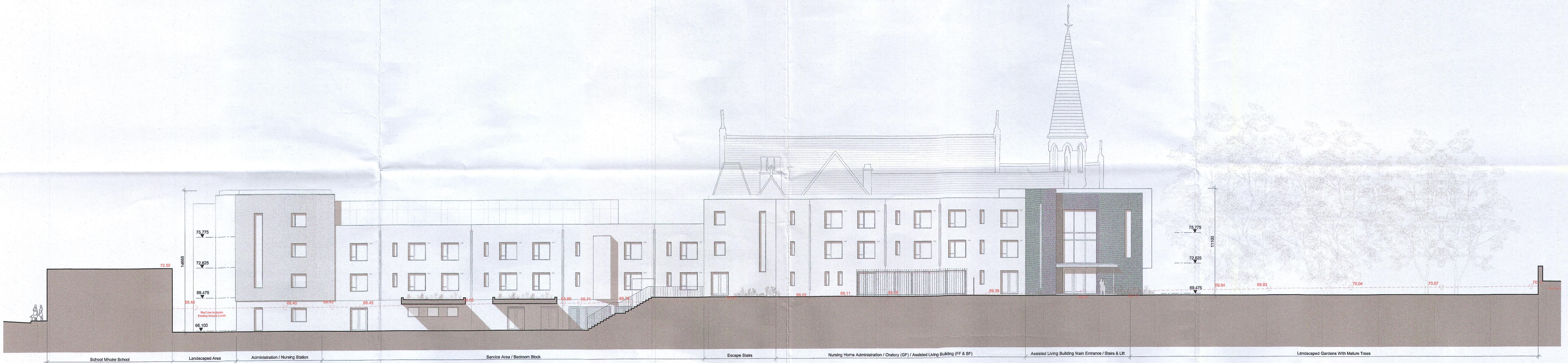
ELEVATION 09 - (SOUTH ELEVATION)