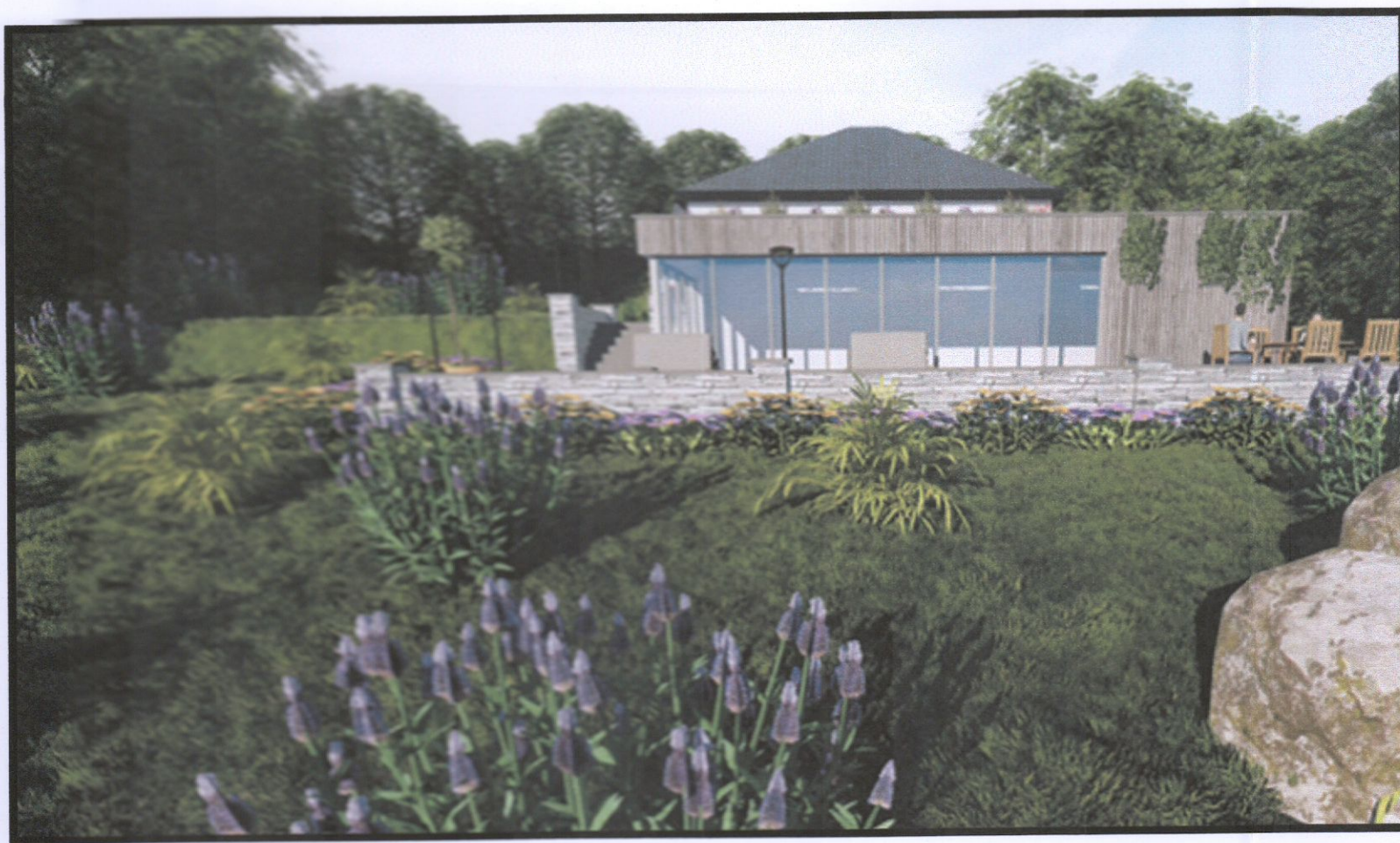
3D Proposed CGI Presentation