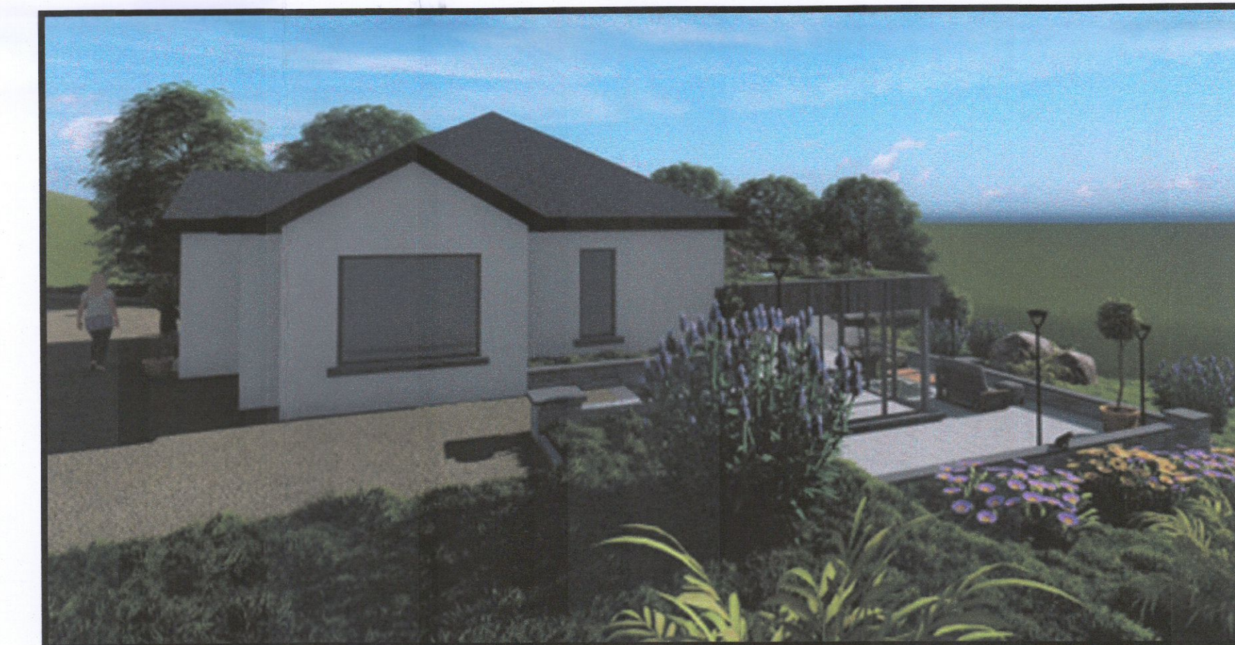
3D Proposed CGI Presentation