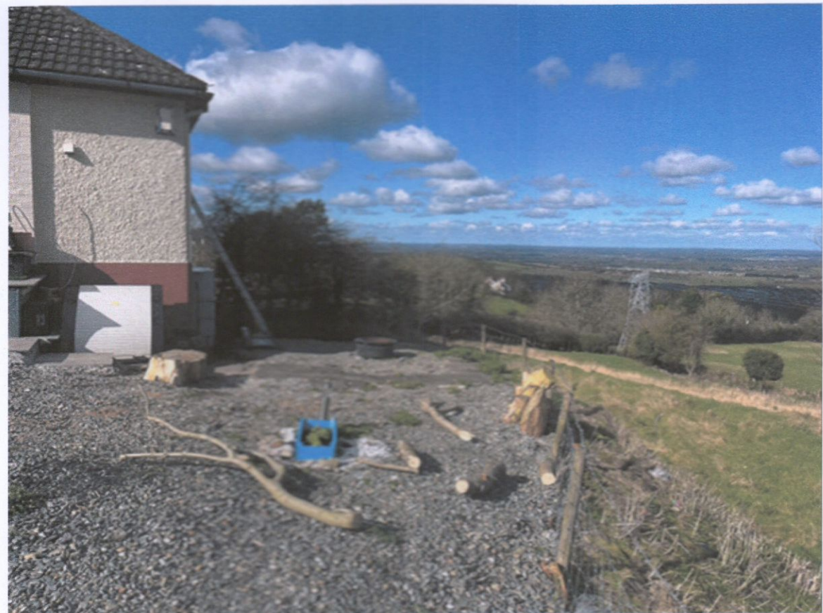
IMG View from North East of Site