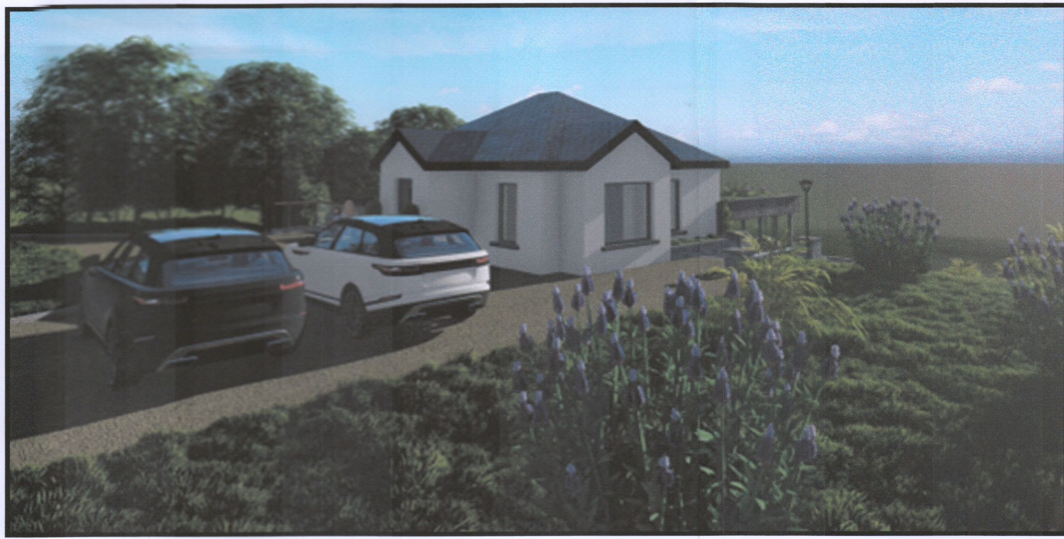
3D Proposed CGI Presentation