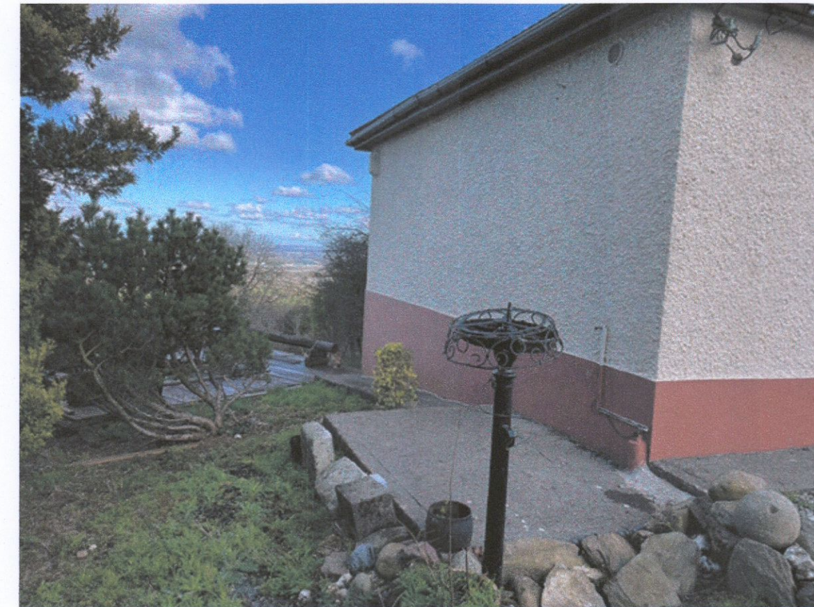
IMG View from South of Site