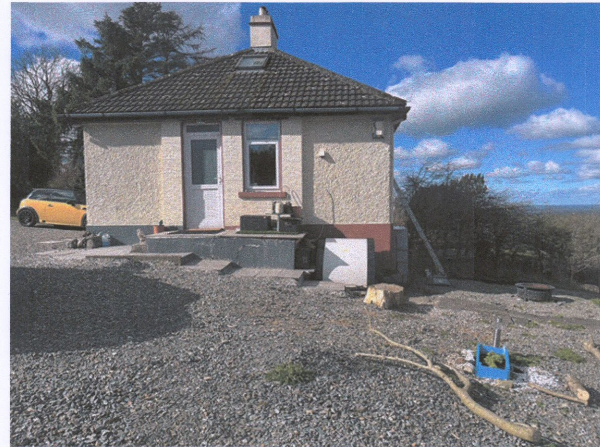
IMG View from North East of Site