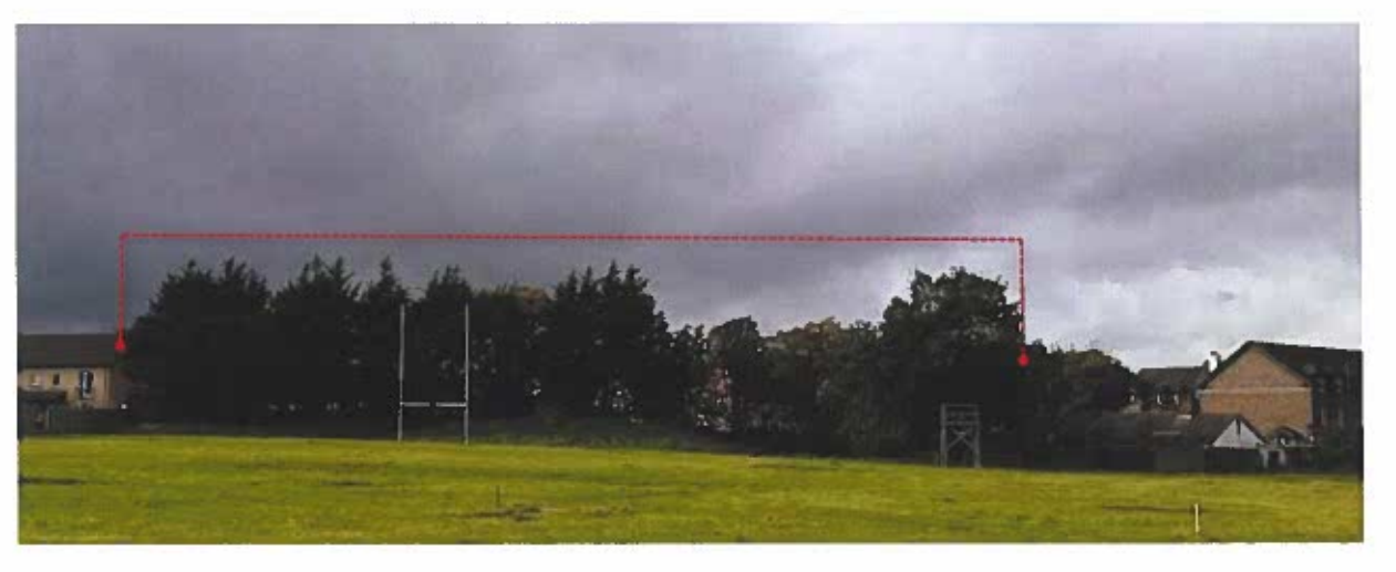
Image 6: Identifies tree number 1253, 1254, 1255, 1255A, 1255B) To be removed prior to construction.

Image 5: Identifies tree number: 1236, 1237, 1238, 1239, 1240, 1241, 1242, 1243, 1244, 1245, 1246, 1247, 1248, 1249, 1249A, 1250, 1251, 1252) To be removed prior to construction.