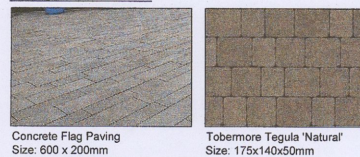
Concrete Flag Paving Size: 600 x 200mm To enclosed Courtyard