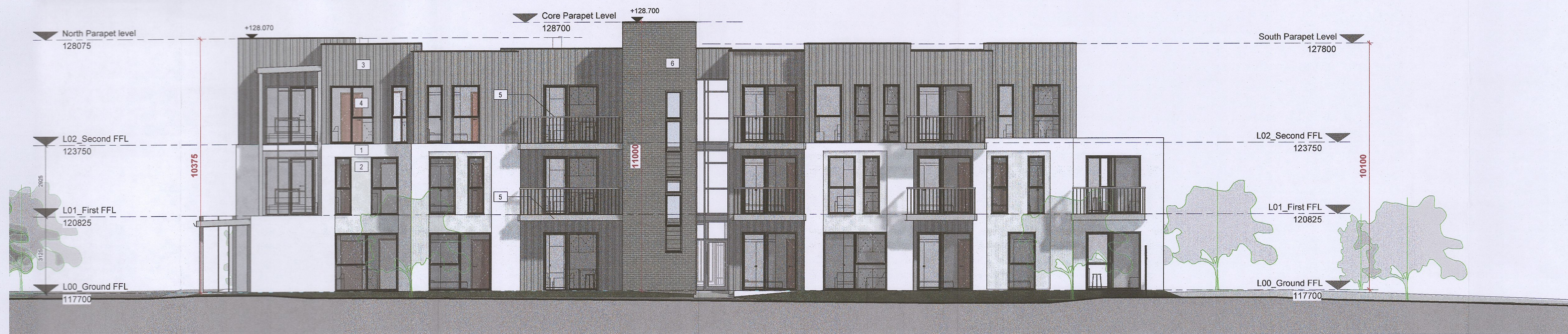
4 Proposed West Elevation Scale: 1 : 100