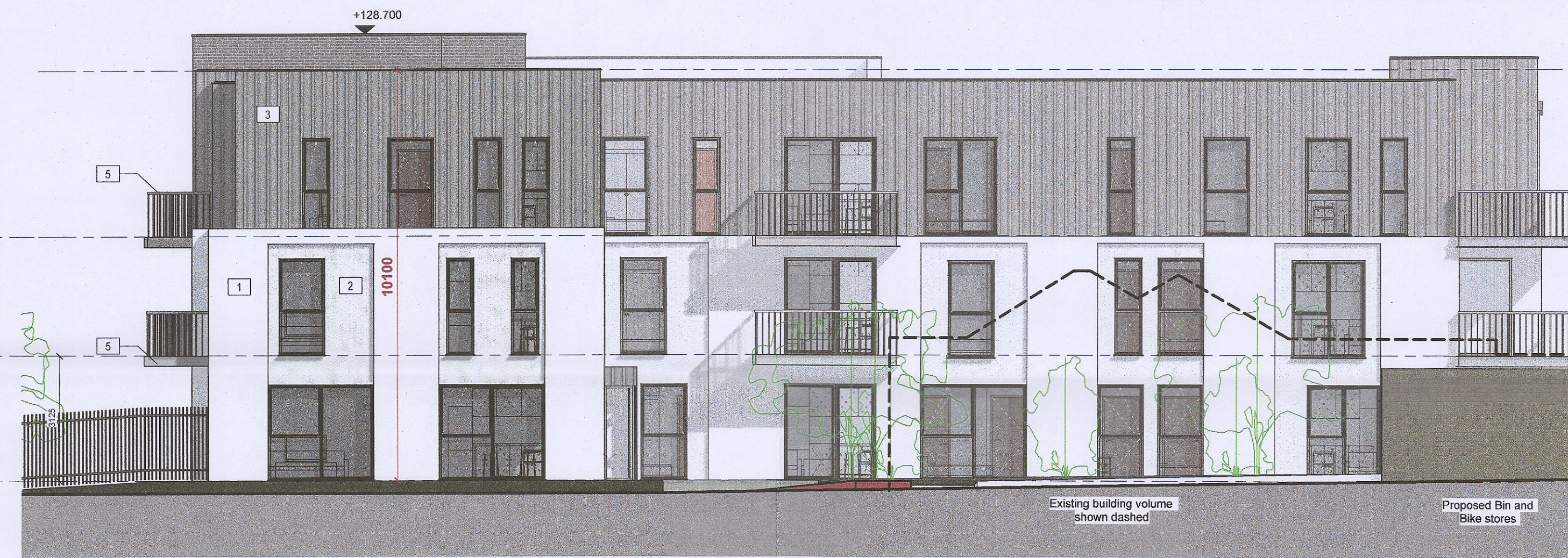
3 Proposed South Elevation Scale: 1 : 100