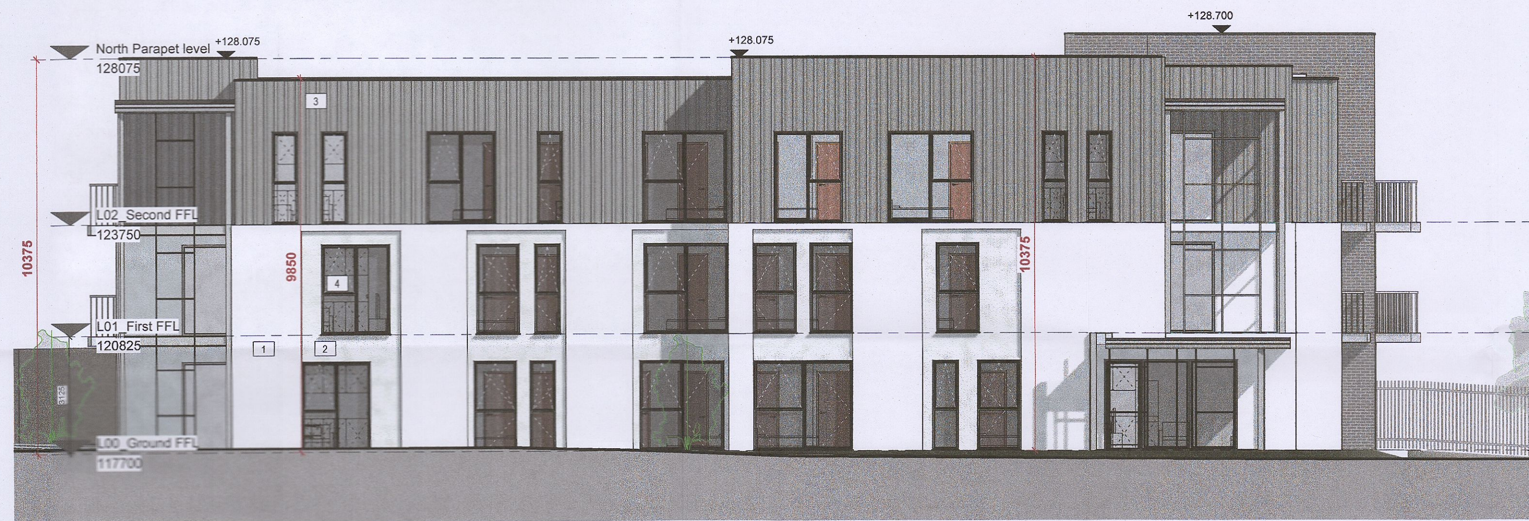
2 Proposed North Elevation Scale: 1 : 100